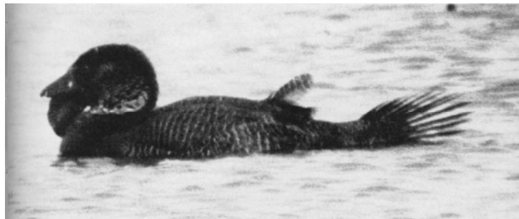
Profile of swimming adult male, above, reveals unusually large lobe that hangs loosely when duck is not displaying.

wise, large numbers will arrive at coastal areas during the winter, foraging in the shallows on invertebrate life. No definite function can be readily attributed to the lobe, which is largest in old males and rudimentary in females, but as it is not hollow it cannot serve for food storage as does a pelican's pouch.