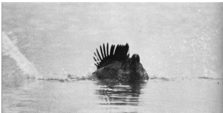
Splashing, above, is part of male's "plonk kick" display during which both feet strike the water with a loud smack.

smaller Ruddy Duck and the similar Australian Blue-billed Duck ( Oxyura australis ), with which it sometimes associates, the Musk Duck is a hardy bird. It is edible, and for a period of time there was a commercial attempt to can and market its meat.