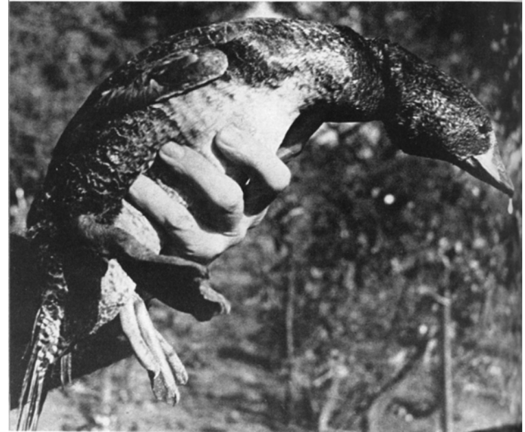
Female, above, is about a foot shorter than male. Note large feet, posterior placement of the legs.

weedy, overgrown marshes and to dive from sight at the first sign of danger. This behavior probably is the reason that relatively little has been written about them.