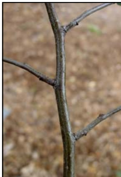
Twigs of many other trees occur singly and alternate from side to side.