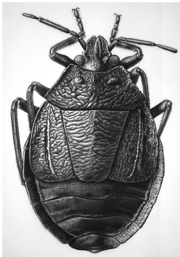
Figure 2. Hondocoris cavei , new genus, new species; dorsal habitus.

Description: Brachypterous; membranes of wings absent, hind wings absent; ocelli absent. Eyes contiguous with pronotum (Fig. 2). Humeral angles weakly and anterior pronotal angles not produced, pronotal margins not explanate. Scutellum short and broad, lateral margins straight, without frenal constriction or discontinuity; apex of scutellum attaining mid-abdomen (5th tergite). Meso- and metasternum thinly carinate on midline. Scent gland orifice round, without spout, but located on caudal side of short raised auricle which extends laterally about one-tenth distance to metasternal margin. Paired trichobothria located on each abdominal sternite behind and about half-way between each spiracle and lateral margin. Antennae five-segmented. Labium arising slightly before anterior limit of eyes; intercalary segment absent; basal segment projecting caudad of bucculae and attaining middle of prosternum. Pro- and mesotibiae prismatic in cross-section; metatibiae sulcate on planar surface. Superior surface of third metatar-