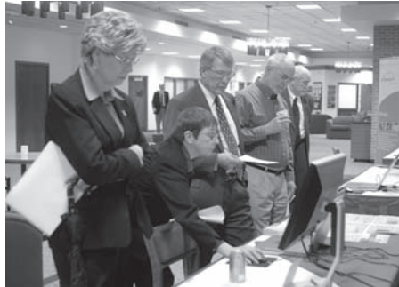
UNL extension hosted a reception celebrating Nebraska leadership for eXtension .