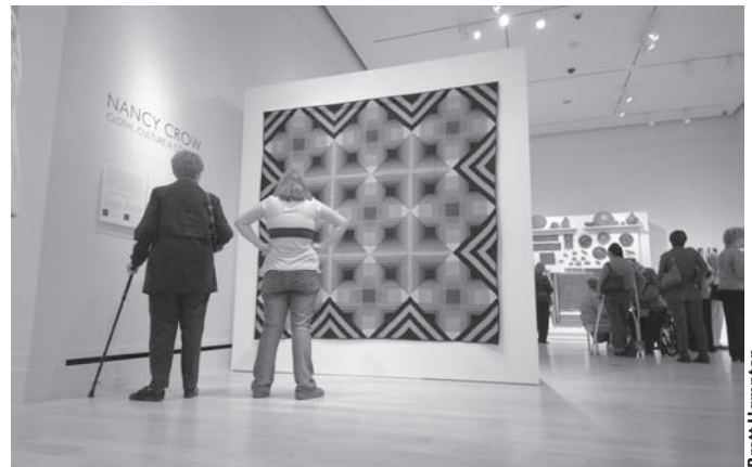
Visitors view quilts at the International Quilt Study Center.

The quilts formerly were stored in the Home Economics Building, which lacked