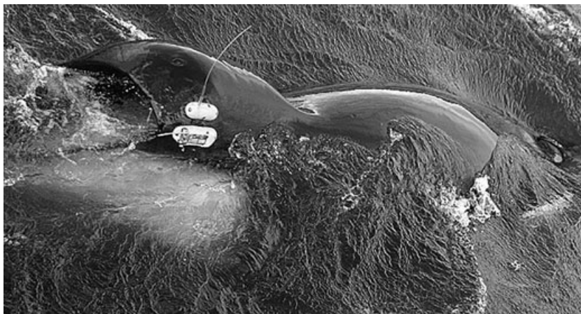
Figure 2. Keiko after arriving in Norway with the VHF tag (on top) and SDR tag (below) mounted to his dorsal fin.

in Norway and a free access enclosure was constructed in Skálvöfjorden, where he remained until his death in December 2003.