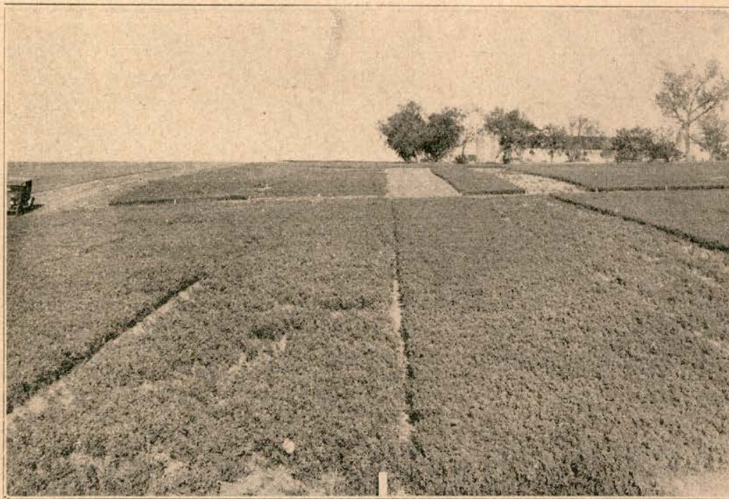
FIG. 3.—Left to right: (1) Spanish-grown, (2) French-grown (Provence), and (3) Italian-grown seed of Common alfalfa; seeded May 16, 1922. The Spanish and Italian strains winterkilled severely in the winter of 1924 to 1925. Photographed May 25, 1925.

Argentine, Italian, and Spanish were materially reduced, the reduction averaging about 50 per cent, as shown in Figures 2 and 3. Results were similar in duplicate plats. No appreciable loss in stand has resulted with any of the other varieties or strains included in this test.