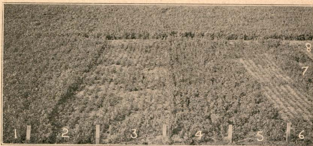
FIG. 4.—Nursery test of alfalfa varieties and regional strains showing winterkilling in winter of 1924 and 1925. Seeded September 6, 1924. Extreme left to right: (1) North Dakota-grown Common, (2) Argentine, (3) Spanish, (4) Nebraska-grown Common, (5) French (Provence), (6) Italian, (7) Russian, and (8) extreme right, Peruvian. The winterkilling results in this nursery test were identical with those of the field plats seeded in 1922. Photographed May 25, 1925.

These tests have not been of sufficient duration to measure fully the inherent differences in productiveness and hardiness. The past winter was sufficiently severe to prove that the Peruvian, Argentine, Spanish, and Italian were not hardy enough for Nebraska conditions. A more severe winter may eliminate additional varieties or strains, since such variegated sorts as Grimm and Cossack are considered to be more winter hardy in the northern states. Until such data are available for Nebraska conditions, it would not seem justifiable to pay a large premium for seed of the variegated varieties when seed of a hardy strain of Common alfalfa is available. In