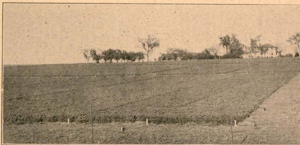
Comparative Test Plats of Varieties and Regional Strains of Alfalfa

THE UNIVERSITY OF NEBRASKA COLLEGE OF AGRICULTURE EXPERIMENT STATION LINCOLN