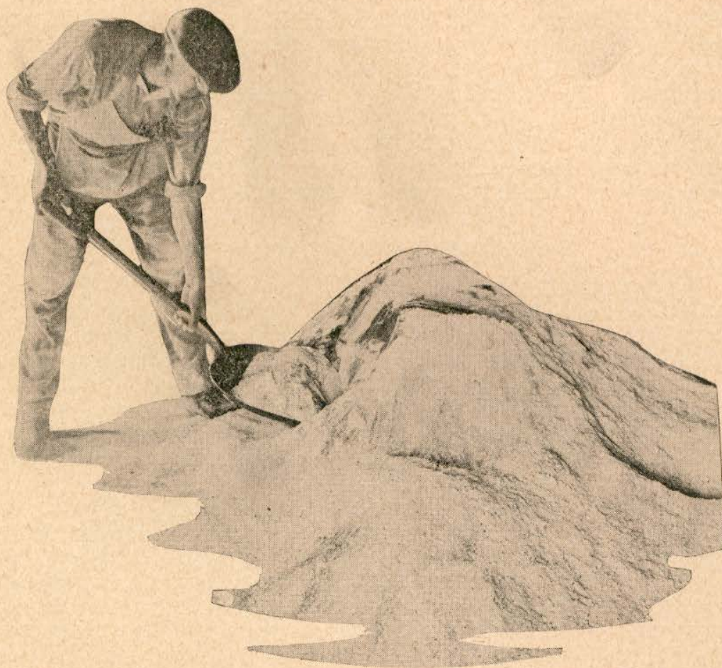
FIG. 2.—The dry-mash ingredients can be well mixed by turning them over on the floor about four times. Whether to buy prepared feeds or mix rations at home is a question of cost, quality, and convenience. Figure the cost of the ingredients in the ration, add a reasonable charge for mixing, and then compare the price of home-mixed feeds with commercial feeds.

feeds, tho the proportions of these varied depending on the season of the year. The pounds of feed required to produce a pound of egg were 4.6 for the general purpose breeds and 3.5 for the Leghorns.