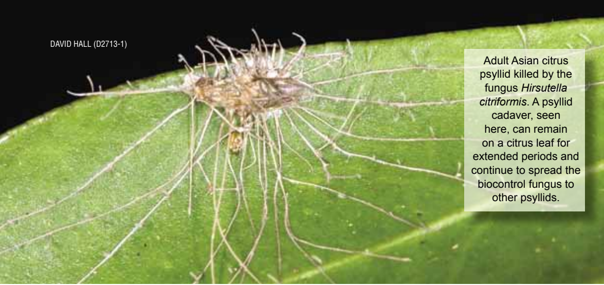
Adult Asian citrus psyllid killed by the fungus Hirsutella citriformis . A psyllid cadaver, seen here, can remain on a citrus leaf for extended periods and continue to spread the biocontrol fungus to other psyllids.

successfully cultured the fungus on media in petri dishes. Five-week-old cultures were sprayed with the compounds. Three of them—copper hydroxide, petroleum oil, and elemental sulfur—reduced the fungus’s ability to infect the Asian citrus psyllid. The other three—copper sulfate pentahydrate, aluminum tris, and alpha-keto/humic acid—did not slow it down.