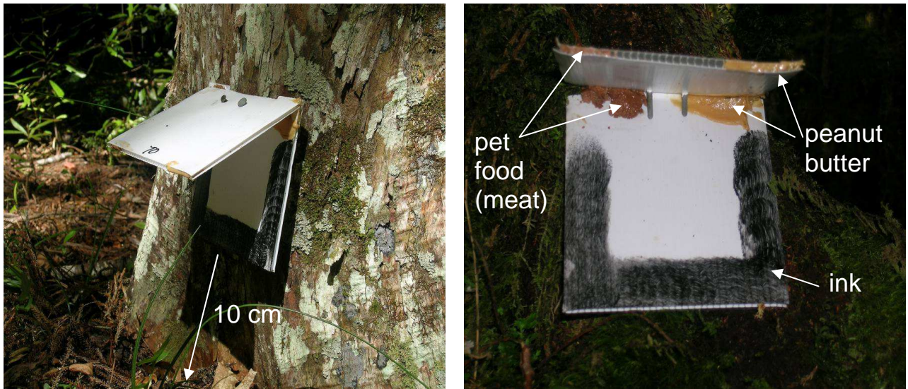
Figure 3. ChewTrack Card design, showing (a) side view, and (b) the location of tracking ink and bait (peanut butter for possums and rodents, meat paste for rodents, stoats and other carnivores).