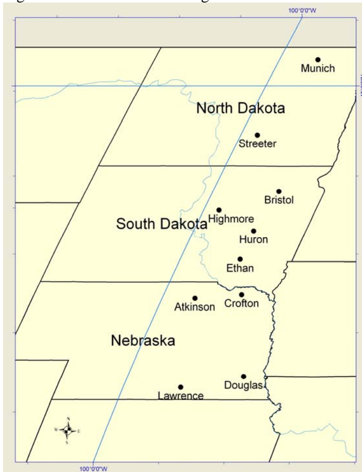
Figure 1. Locations of Switchgrass Fields

Farm cooperators managed all aspects of crop production and harvest except that the Nebraska switchgrass fields were planted by USDA-ARS, Lincoln, personnel. A general set of recommended management practices, based on previous small plot research, were given to all farm cooperators. These management practices detailed seedbed preparation, planting depth, planting dates, herbicide use, and harvesting dates. Cultivars selected for each field were based on prior research within respective geographical regions. Seeding rates were 322 pure live seed (PLS) m 2 . Soil samples were taken on each field before switchgrass establishment to assess soil fertility. No fertilizer was applied the establishment year. Subsequent fertilization recommendations ranged from 60 to 100 lbs N per acre, varying with the potential productivity,