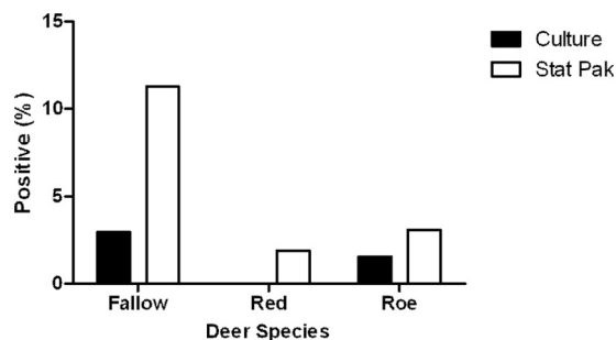
FIG. 2. Prevalence of M. bovis in the different deer species as determined by culture and STAT-PAK.

ity, 73%; specificity, 100%) with experimentally infected C. elaphus (10). However, comparisons between different deer species must be interpreted with caution, as different species vary in susceptibility to bTB (16) and experimentally infected animals may yield a higher test sensitivity than naturally infected free-ranging animals (13).