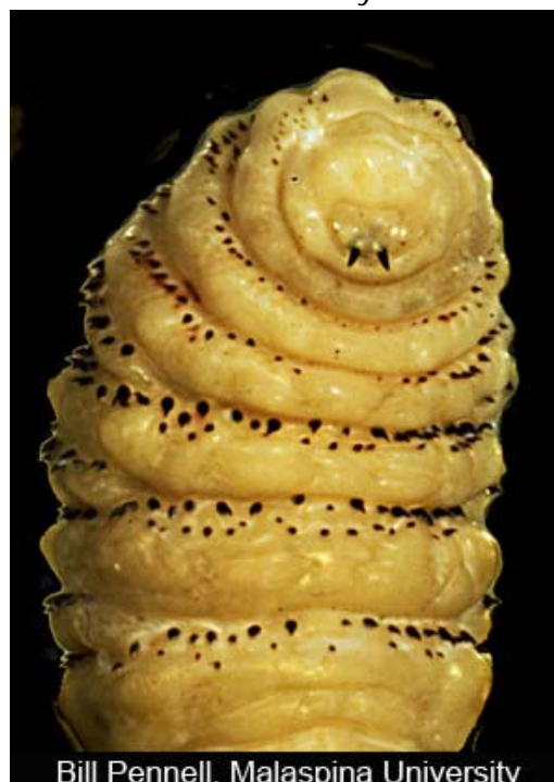
Figure 2. Third-stage larva of a human bot fly, Dermatobia hominis , showing hooked mouthparts and many rows of holdfast spines.