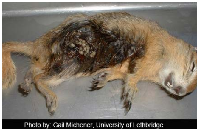
Figure 3. Lethal myiasis of a squirrel, Spermophilus richardsoni , caused by the sarcophagid fly, Neobellieria citellivora .

Figure 3. There is no doubt that Dermatobia hominis causes some discomfort as it feeds and grows in its mammalian host's musculature. However, in some species the myiasis-causing flies can cause extensive tissue damage and be responsible for significant mortality in the host's population. Such lethal parasitism is known from a diversity of vertebrate hosts in nature, including certain frogs, chipmunks, ground squirrels and birds. Myiasis-causing flies can also be a significant pest of livestock, especially cattle and horses.