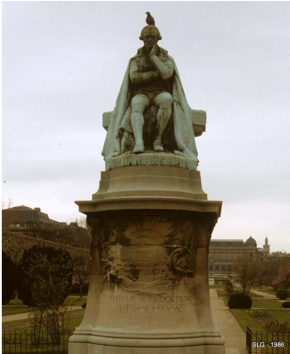
Figure 5. Statue of Jean Baptiste Lamarck, Founder of the Doctrine of Evolution. This is in the Jardin de Plantes of the National Museum of Natural History in Paris and behind can be seen the Galerie de Zoologie before its renovation.