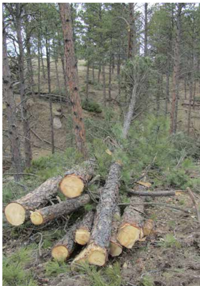
Figure 2: Forest residue being generated through fuels reduction.

Since European settlement, the Pine Ridge has always supported some form of a forest products industry. Many of the older homes and outbuildings in the area were built with locally milled lumber. Opportunities to market raw forest products from the Pine Ridge have been sporadic at best. These markets have been driven by shortages (physical and political) of similar raw products in other areas. For instance, there was a pulp wood market in the 1960's where pulp wood was hauled via rail to the Lake States due to a temporary local shortage. The sawlog market, which lasted from the late 1980's until about 2008, evolved as a result of the Black Hills National Forest reducing their allowable sale quantity. This