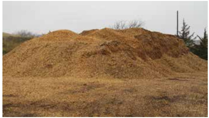
Figure 3. Wood fuel storage site for the Chadron State College biomass boilers.

In early 2016, the Nebraska Forest Service will be contracting for the completion of a forest resource growth and drain study to quantify the expansion and growth of the forest resource. This study is being tailored to provide information to potential businesses interested in sourcing products or