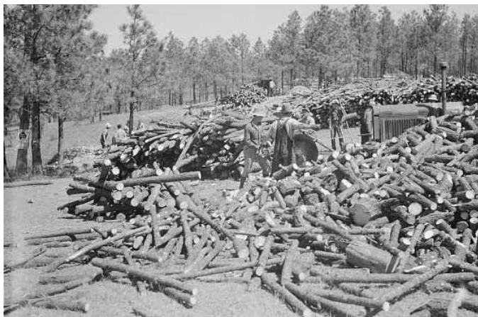
Figure 1: Bolts being prepared for use as fence posts.

The Pine Ridge is a rocky precipice rising several hundred feet from the surrounding plains, composed of sandstone, siltstone and volcanic ash. This pine-dominated escarpment was formed during the same geological timeframe as the southern edges of the Black Hills of South Dakota.