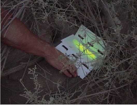
Fig. 1. Placement of a sticky trap baited with a chemical light stick in a typical sand fly habitat at Tallil Air Base, Iraq.

attached to a 20- by 7-cm "cockroach" sticky trap (Fig. 1). Carbon dioxide or other supplemental attractants were not used. Evaluations were conducted in a 2,500-m 2 area of desert scrub habitat intermixed with piles of brick and stone building rubble, in an area with no prior vector control or insecticidal activities. Traps were placed \approx 0.5 m above the ground and 30 m or more apart. After each trap night, the number of sand flies collected in each trap was determined. Sand flies were placed in vials with 75% ethanol and shipped to the Walter Reed Army Institute of Research (WRAIR) for identification to species. The trap evaluation consisted of two replicates of a 4 by 4 Latin square design. Trap, day, and location effects were evaluated using a three-way analysis of variance (ANOVA) (SAS Institute 1995). Trap data were transformed to \log_{10}(x + 1) before analysis. Multiple comparisons were made using Duncan multiple range test ( \alpha = 0.05 ).