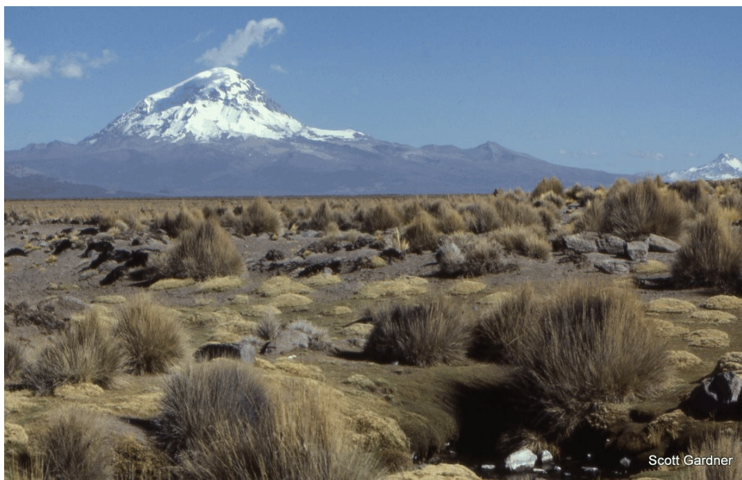
Fig 3. Nevada Sajama, Oruro, Bolivia, 1986.