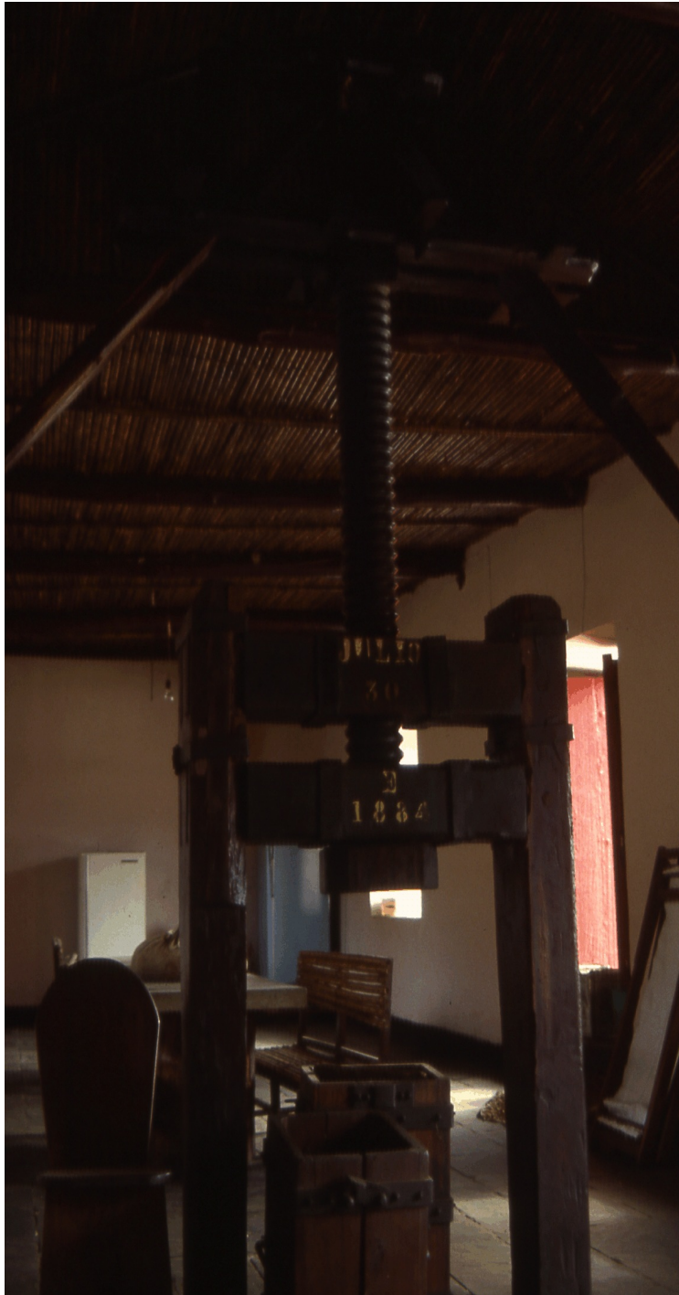
Figure 1. An old coca press - photographed at Chichijipa, Bolivia 1985.