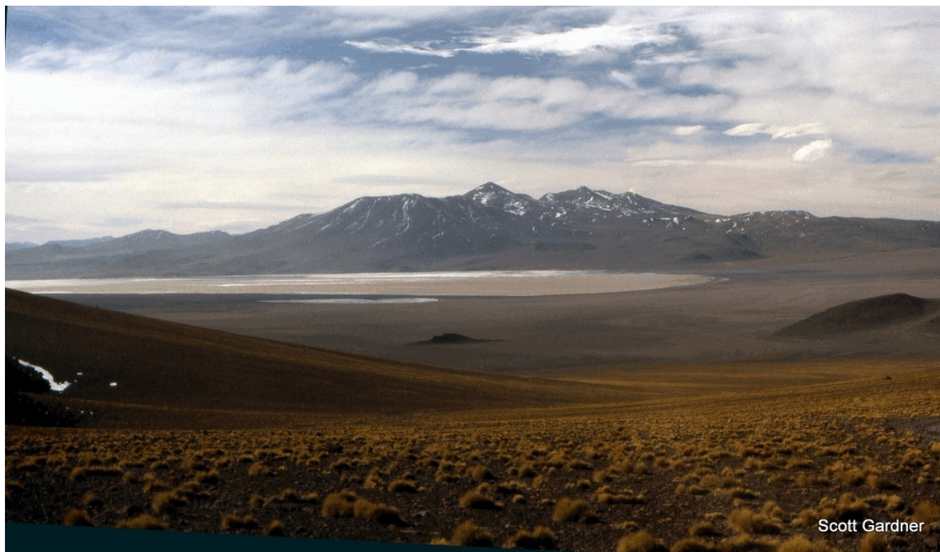
Fig 2. Laguna Colorada, September, 1986.