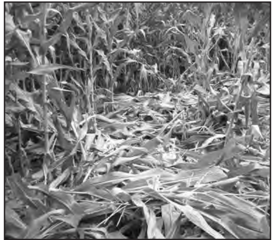
Raccoon damage to field corn.

In areas of sparse forest, the distribution and density of wildlife populations often varies directly with the abundance of woody cover (Bayne and Hobson 2000, Virgós 2002, Pardini et al. 2005, Beasley et al. 2007a); thus, studies identifying forested habitat as an important factor influencing crop damage often imply that increased animal abundance is the underlying mechanism governing the amount of damage sustained by crops. Previous research has identified landscape components associated with forested habitats as being critical factors influencing the amount of wildlife damage to crops at both local and landscape scales