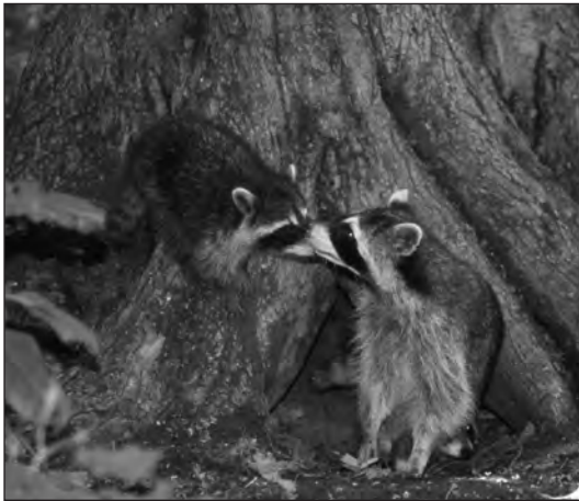
Female raccoon with young.

includes parameters for initial capture ( p ) and recapture ( c ) probabilities, but differs from other estimators in that N is a derived parameter from the number of unique animals captured and p (Finley et al. 2005). The exclusion of population estimates from the likelihood function allows initial efforts to be centered on obtaining parsimonious estimates of p and c for the combined data set, which then can be used to generate more accurate estimates of N for subsets of the data (e.g., forest patches; White 2005).