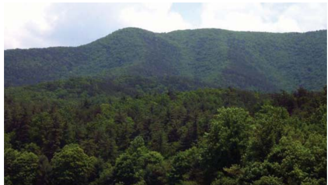
Pine stands on the west-facing slopes of Brush Mountain, Virginia.

Now, thanks to these researchers and the scores of pine tree cross sections they painstakingly acquired, the once-hidden secrets of fire history in the central Appalachians are preserved and revealed in the unmistakable black and white of the rings.