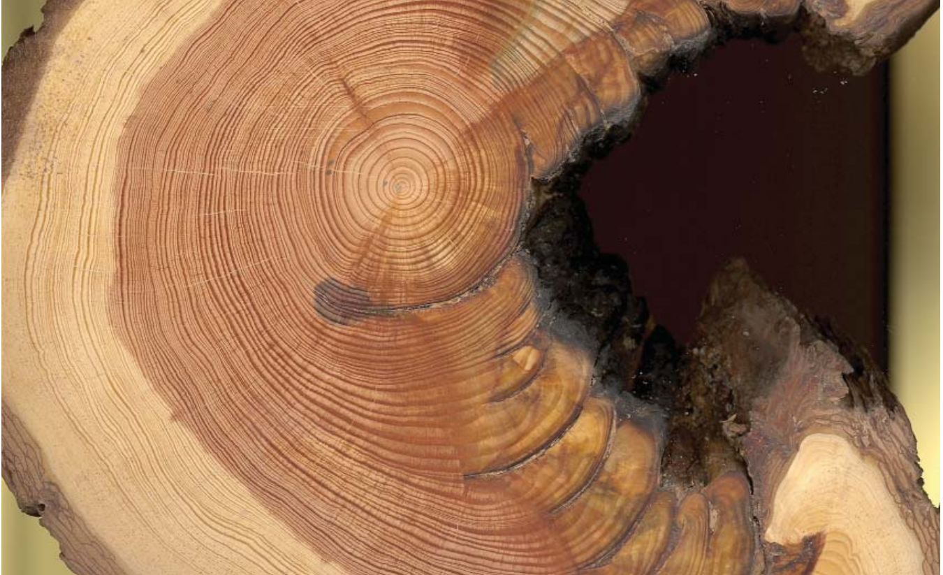
Fire-scarred cross section collected from the Kelly Mountain site in the George Washington National Forest.