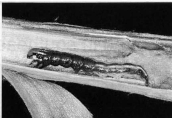
Common stalk borer

Winter wheat is ripening and a few fields have some minor rust infections. The first cutting of alfalfa is complete with excellent regrowth. Grasshoppers are continuing to hatch immediately