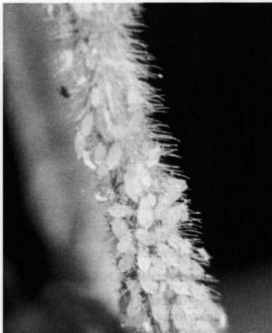
Hundreds of soybean aphids can gather on a single soybean stem.

The seasonal life cycle of the soybean aphid is complex with up to 18 generations a year. It requires two different species of host plant -- buckthorn and soybean -- to complete its life cycle. Buckthorn, a woody shrub or tree, is the overwintering host plant of the aphid. Soybean aphids lay eggs on buckthorn in the fall. These eggs overwinter and hatch in the spring, giving rise to wingless females. These females reproduce without mating, producing more females. After two or three generations on buckthorn, winged females are produced that migrate to soybean. Multiple generations of wingless female aphids are produced on soybeans until late summer/fall, when winged females and males are produced and migrate back to buckthorn, where they mate. The females then lay eggs on buckthorn,