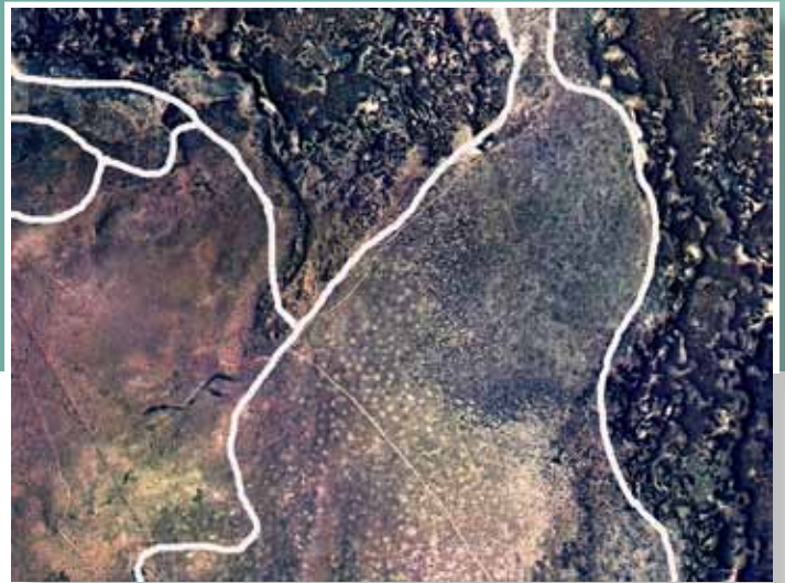
LAURA M. BURKETT (D2932-1)

Then the team developed ecological-state descriptors for different soils. They assessed factors such as USDA's Natural Resources Conservation Service (NRCS) soil data, STM soil characteristics, plant functional groups, responses to disturbance, and soil erosion patterns. Through this process, the scientists