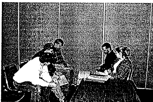
The community development team brainstorms ideas for an upcoming event.

The final team is the executive team which consists of a faculty advisor, director, revolving secretary, and the co-leaders of the three development teams. Any ideas for club activities can be initiated by members submitting a proposal form to the executive team.