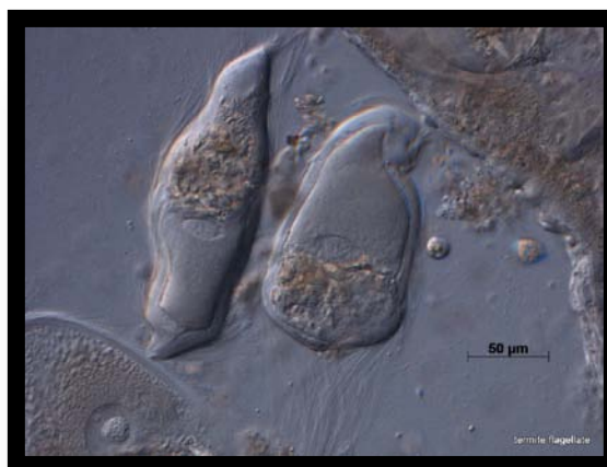
Figure 1. Zeiss - Normarsky micro-image of flagellates from a specimen of Reticulitermes showing small wood bits in the posterior ends of these individuals. The wood bits are pieces of rotten western red-cedar.