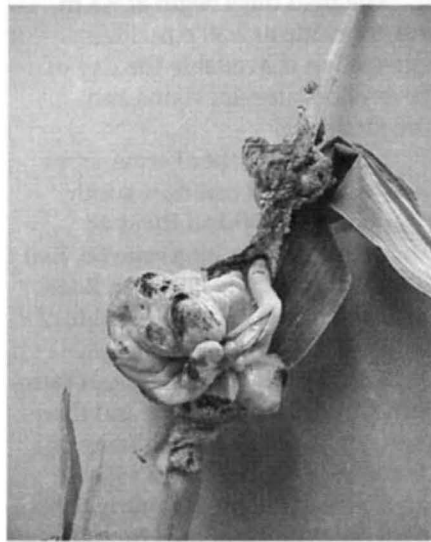
Common smut on corn.

Poor pollination: This would be for smut occurring on the ear. This also tends to be why we see smut at the ear tips when we have incomplete pollination.