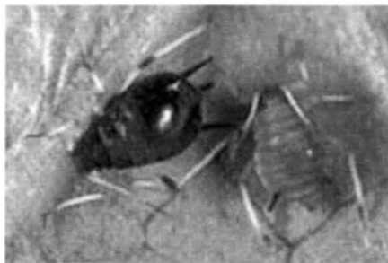
Cowpea aphid

The cowpea aphid is easily distinguished from other aphids in alfalfa largely because it would be the only black aphid. In general, it is a relatively small aphid, less than 2 mm long. Non-winged and winged adults are usually shiny black while the smaller nymphs may appear to be a dull gray to black. The first half of the antennae is white, and the legs are usually a creamy white color with blackish tips. In alfalfa, these aphids