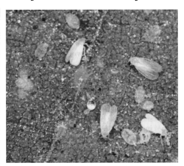
Producers in central and eastern Nebraska are reporting unusually high numbers of whiteflies.

ture and adult stages. The adult stage is about 1/16th inch long, with four whitish wings and a yellowish body. The wings are held roof-like over the body and are more or less parallel to the leaf surface. The adults are easily disturbed and often fly up as you walk through a field. The nymphs feed on the undersides of leaves.