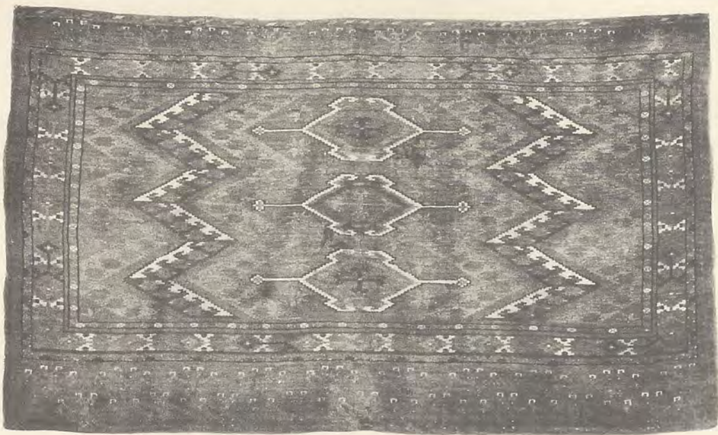
CARGO CARRIER (front face), Central Asia, Ersari/Beshir, 19th century, The Textile Museum R37.4.4. Acquired by George Hewitt Myers in 1915.

3) Embroidery ( suzani ) was a domestic art practiced by young women who expended great effort in preparing their dowry. The silk embroidery thread was bought in the bazaar; the cotton or linen fabric might be homespun or purchased, but was typically ornamented by hand using a needle ( suzan in Persian and Tajik languages). Groups of girls might work together to decorate a large cover. Each region has its own embroidery style, with considerable variety in the quality and coarseness of the foundation fabric. But in many areas the most substantial embroideries of whatever grade are large hangings used as covers and for ornamental display.