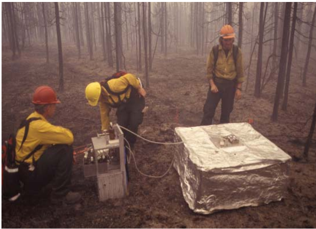
Measuring smoldering and residual emissions.