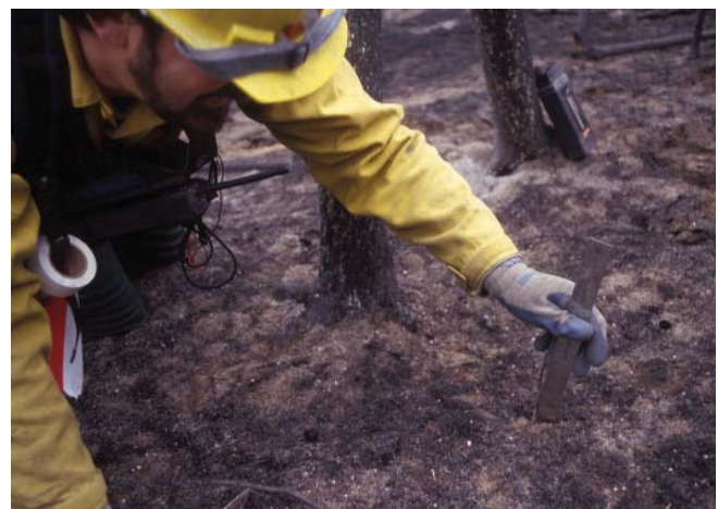
A researcher measures post-fire depth of the organic layer to determine how much was consumed.

were identified as potential smoldering sources. Each plot was revisited in the same order each time at intervals of 1 to 4 hours. Background samples of the ambient air were collected periodically as well.