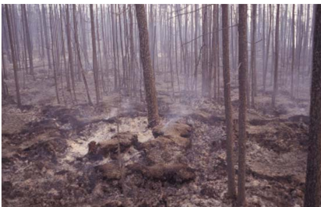
Moss and duff are capable of smoldering for weeks or months after the passing of active flames.

Combustion of this material is highly inefficient and generally occurs during the smoky smoldering phase. When moisture levels are 30 percent or below, dry moss and duff will burn on its own until quenched from above by rainfall or from below by a wet layer. Once it ignites it can smolder slowly for weeks or months, generating tremendous quantities of smoke over long periods. This can mean hazardous air quality for downwind residents and communities, low visibility and lingering regional haze.