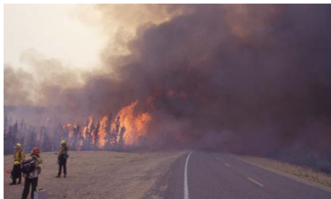
Flames converge on the Taylor Highway as fire/research teams retreat. Fires burning along major highways gave scientists unprecedented access.

much to do with consumption of trees, logs and branches. In his own early work Ottmar determined that the proportion of the forest floor reduction is influenced by lower forest floor moisture content and pre-burn depth. The relationship holds as long as the relative humidity is less than 40 percent. That’s when the surface layer is dry enough to carry fire and sustain combustion hot enough to ignite the lower layers. This project was the chance to sort out the details and feed it all into a predictive model that would dovetail into Consume.