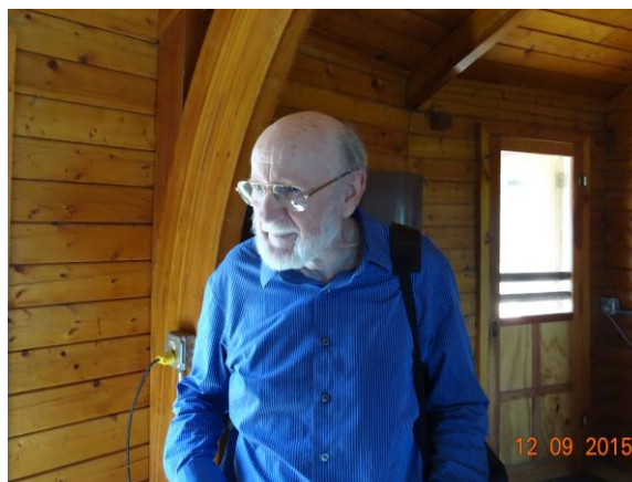
William C. Campbell, long-term ASP member, guest at the Rocky Mountain Conference of Parasitologists, September 2015, and recipient of the 2015 Nobel Prize in Physiology or Medicine!