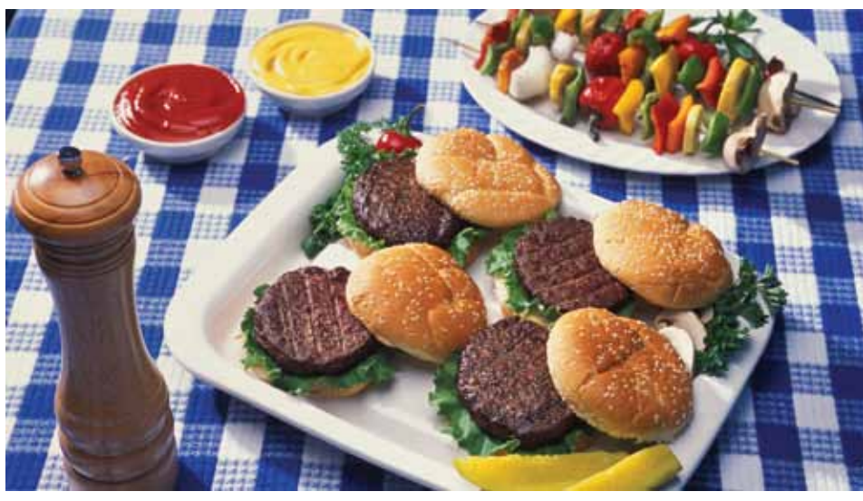
STEPHEN AUSMUS (K9988-1)

The ability of olive extracts to kill foodborne pathogens has been reported in earlier studies conducted at Albany, Tucson, and elsewhere. However, the E. coli and amines study, reported in a 2012 issue of the Journal of Agricultural and Food Chemistry , may be the first to show olive powder's performance in concurrently suppressing three targets