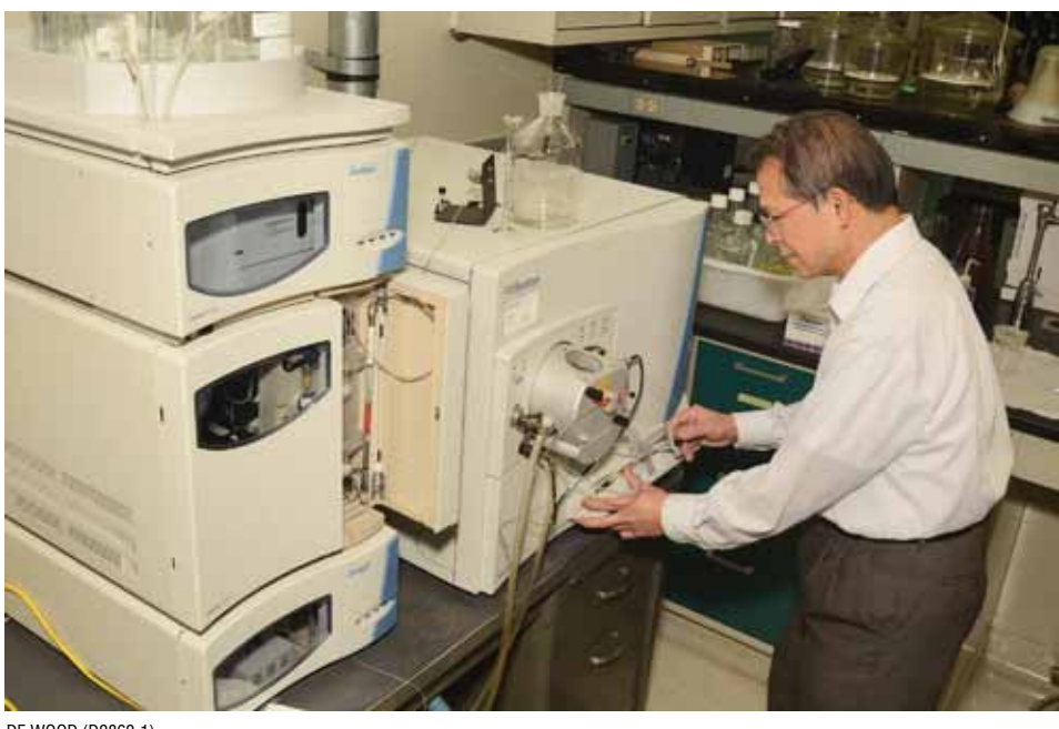
DE WOOD (D2862-1)

Each of the three fatty acids in a triglyceride is attached to what scientists describe as a "glycerol backbone," explains chemist Ken Lin. The bonds occur along the backbone at specific positions. For every type of triglyceride, the three fatty acids bond to glycerol in specific patterns.