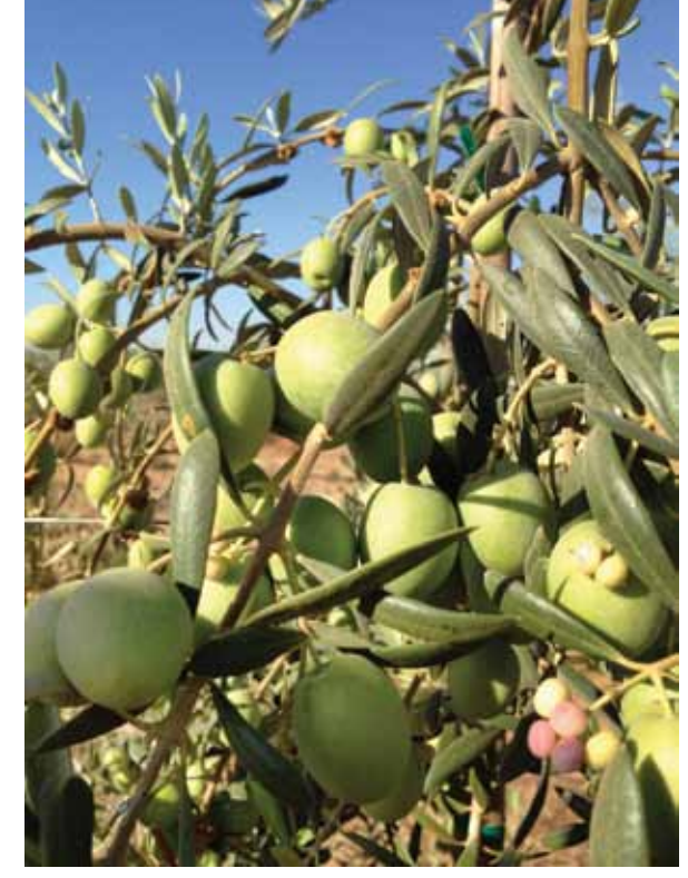
Fully mature olives growing in a California orchard. The state's 2012 olive harvest of 320 million pounds was worth about $130 million.

of concern—two major amines and a pervasive E. coli .