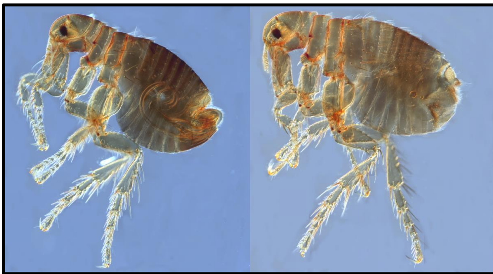
Pulex irritans , male and female

Senior Fellow, Manter Laboratory of Parasitology