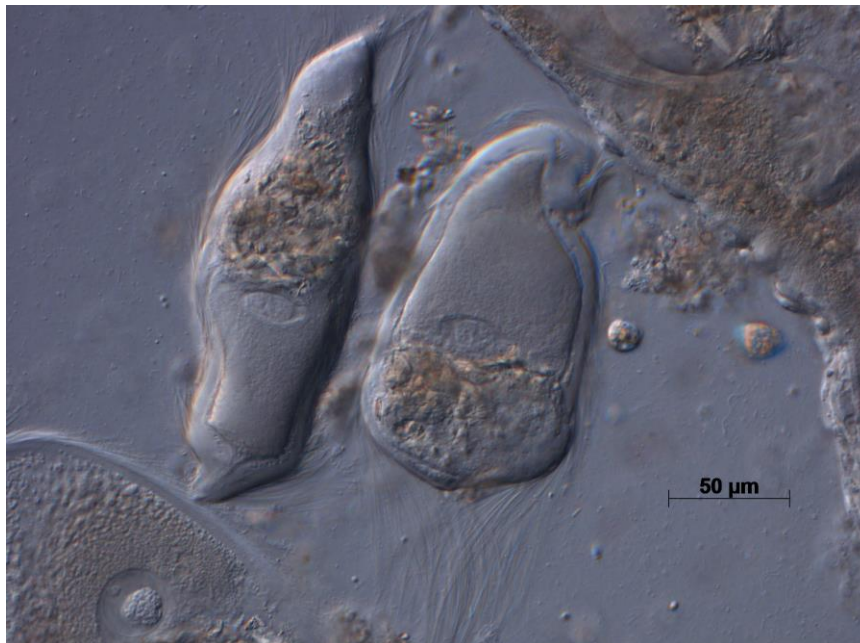
Protistans from the gut of a termite.