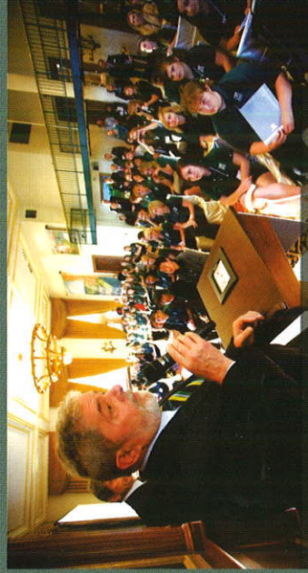
World Food Prize Foundation

– Student participant, World Food Prize Nebraska Youth Institute