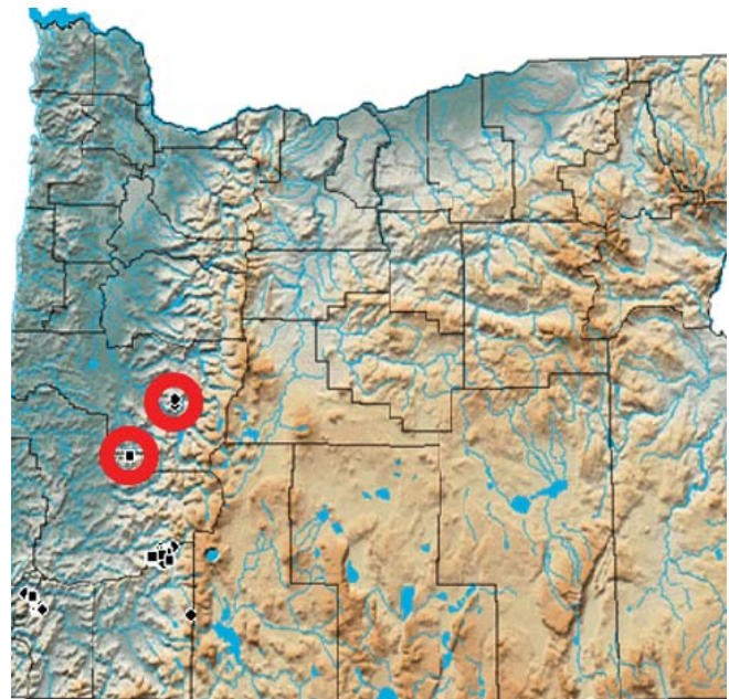
Frasera umpquaensis populations in Oregon (black dots). Elk Meadows, Alpine trail/Elk Camp Shelter, Nevergo Creek, and Sourgrass Mountain are circled in red.