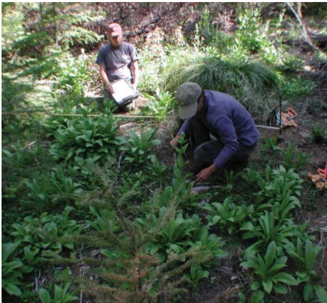
Field sampling crew in 2003, the first year after fire, measuring plants in an unburned patch.

By safeguarding the plants and preserving their lifecycles, we can hope they carry on their reproductive efforts—flowering, seeding, perpetuating their populations.