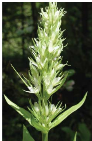
(Left) Photo of Umpqua gentian or Frasera umpquaensis inflorescence.

agencies, and the Bureau of Land Management (BLM) and the Forest Service developed a conservation strategy to maintain viable populations of genetic diversity (necessary for any species—plant, animal, microbial—to be able to adapt to changing conditions). To that end, researchers have monitored three populations of Umpqua gentian on the Medford District of the BLM since 1995.