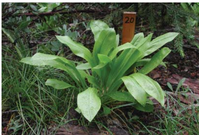
A plant in 2004, recovering from fire.

After the Biscuit Fire burned Umpqua gentian habitat, populations at the three sites declined from 2002 to 2003. The decrease in non-seedling plants was directly related to the amount of area that burned in each plot. Umpqua gentian numbers then rebounded from 2003 to 2004 to levels similar to those seen before the Biscuit Fire. This, Kaye and the team feel, indicates a great recovery in the plant's numbers.