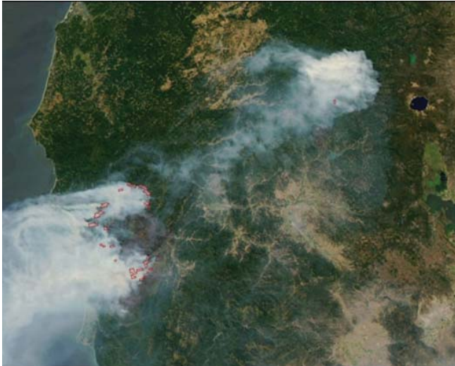
The Biscuit Fire, a convergence of multiple fires ignited by lightning, in a patchy mosaic of lightly burned to severely burned areas.

From July 12 to 15, 2002, 12,000 known lightning strikes hit Oregon, flaring into 375 fires. Four fires—the Biscuit, Sour Biscuit, Florence, and West Florence fires merged into one—The Biscuit Fire. Fire personnel recognized the difficulties they were having in fighting the fire resulted from a number of factors, such as lands that varied abruptly from rainforest to savanna, from rugged terrain, to flats.