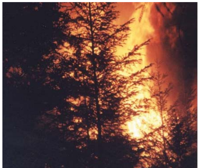
Close-up view of the 2002 Biscuit Fire.

While fire damaged plants that were burned, fire may have provided a slight boost to unburned plants. By releasing nutrients into the soil, fire may have contributed to the size increase in unburned plants in the two to three years after the Biscuit Fire.