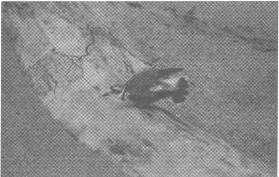
Figure 1. Piping plover performing broken wing display near nest on the Kansas River.

On 10 July 1996, one adult piping plover on a nest with three eggs was found along the Kansas River upstream of Wamego, Kansas. When flushed from the nest, the adult performed a broken wing display before returning to the nest (Fig. 1). Only the one adult was seen during 20 min. of observation. The nest was located on a shallow ridge of coarse sand less than 20 m from the river. The site was on a new channel of the river created during high water in 1993. The sandbar was approximately 700 m long, up to 500 m wide and was unvegetated except for patches of recently established willow ( Salix sp.). When this site was revisited on 17 July the nest contained two eggs and one chick (Fig. 2).