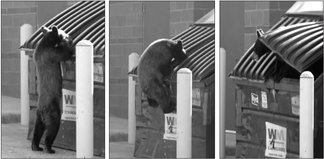
Figure 2. Nuisance bears that are anthropogenic feeders can be identified by trans fatty acid biomarkers found in their fat. This black bear has learned where to find an easy meal.

to whether the bear that was ultimately trapped or shot is the same one that was involved in the initial conflict. This uncertainty may result in some non-problem bears being unnecessarily destroyed, as well as real problem bears not being adequately managed (Wolfe 2008).