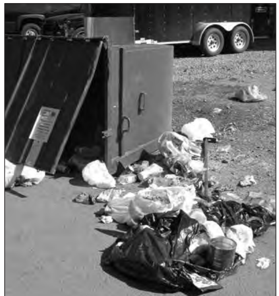
Figure 1: Evidence of bear activity at a dumpster.

positively identifying a food-conditioned bear may be difficult. In many cases, a bear is trapped or shot in the vicinity of a conflict sometime after the problem has occurred (Madison 2008, Beckmann and Lackey 2008). Consequently, there may be some uncertainty as