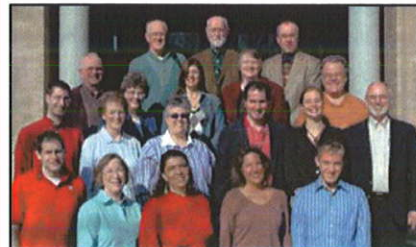
Recipient of 2007 University of Nebraska Departmental Teaching Award

Office of Admissions University of Nebraska-Lincoln Alexander Building 1410 Q Street Lincoln, Nebraska 68588-0417 (402) 472-2023 or (800) 742-8800 ext. 2023 E-mail: nuhusker@unl.edu http://www.unl.edu