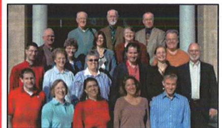
Recipient of 2007 University of Nebraska Departmental Teaching Award

Office of Admissions University of Nebraska-Lincoln Alexander Building 1410 Q Street Lincoln, Nebraska 68588-0417 (402) 472-2023 or (800) 742-8800 ext. 2023 E-mail: nuhusker@unl.edu http://www.unl.edu