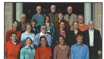
Recipient of 2007 University of Nebraska Departmental Teaching Award

Office of Admissions University of Nebraska-Lincoln Alexander Building 1410 Q Street Lincoln, Nebraska 68588-0417 (402) 472-2023 or (800) 742-8800 ext. 2023 E-mail: nuhusker@unl.edu http://www.unl.edu