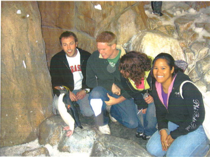
Ecotourism class at Omaha Zoo