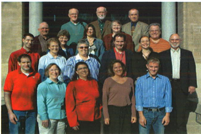
AgLEC department received the 2007 University-wide Departmental Teaching Award