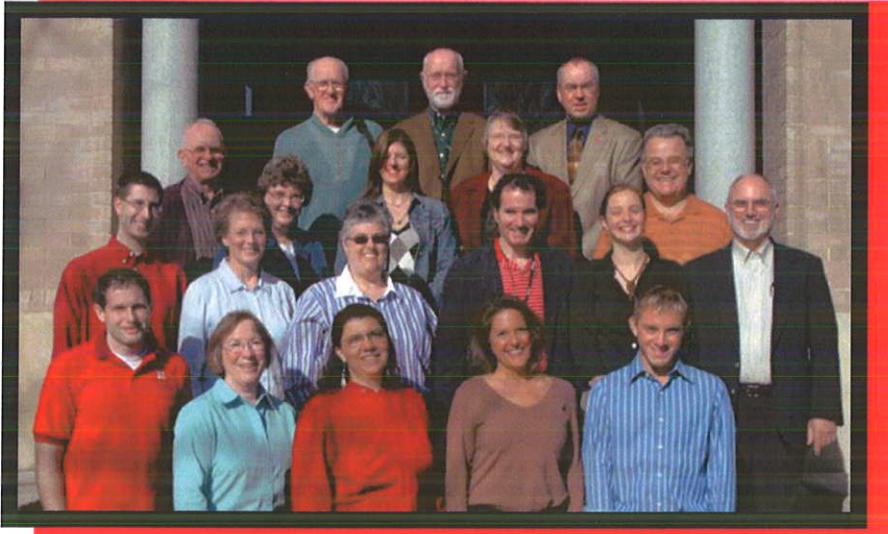
Recipient of the 2007 University of Nebraska Departmental Teaching Award