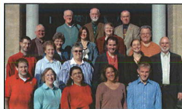
Recipient of 2007 University of Nebraska Departmental Teaching Award

Office of Admissions University of Nebraska-Lincoln Alexander Building 1410 Q Street Lincoln, Nebraska 68588-0417 (402) 472-2023 or (800) 742-8800 ext. 2023 E-mail: nuhusker@unl.edu http://www.unl.edu