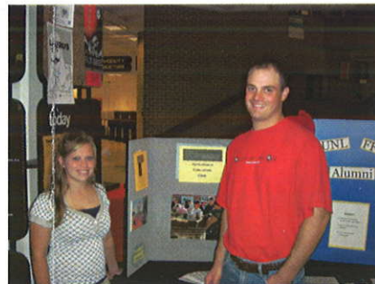
Ag Ed Club