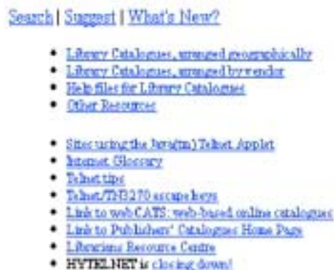
FIGURE 1. Portion of the HYTELENET Web Interface Main Screen as of December 1999

HYTELENET 18 is still available as an http protocol site. In 1997, Peter Scott announced the discontinuation of its maintenance. Figure 1 depicts the main screen of the Hytelnet Web site "HYTELENET on the WorldWideWeb" ( http://www.lights.com/hytelnet/ ).