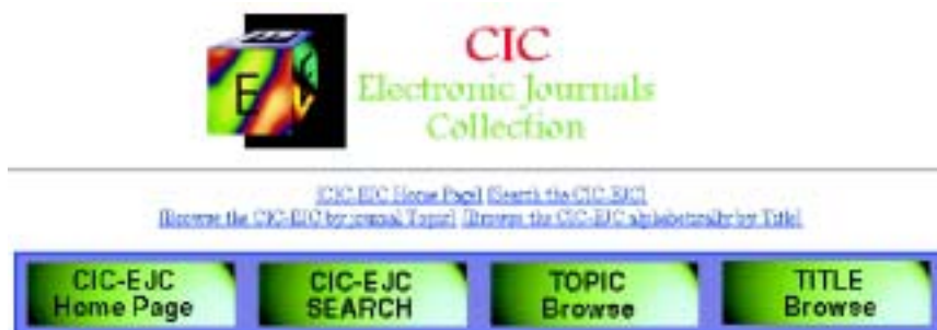
FIGURE 7. Committee on Institutional Cooperation Electronic Journal Collection Menu as of December 1999

The aforementioned Committee on Institutional Cooperation (CIC) site was one of the first comprehensive, organized listings of electronic journals. From its beginnings as a gopher site in 1991, it gave both subject and title browse lists. Figure 7 depicts the Electronic Journal Collection menu that has not changed since its inception. The "Topic Browse" listing was by broad subject categories that arose from the subject areas represented by the journals available. Their web page states, "Ultimately, this collection aims to be an authoritative source of electronic research and academic serial publications—incorporating all freely distributed scholarly electronic journals available online. The CIC-EJC serves as the electronic journal collection for the CIC member university libraries. The collection is fully cataloged by the CIC member libraries, and records are contributed to the international bibliographic database OCLC. Ultimately, the collection will include