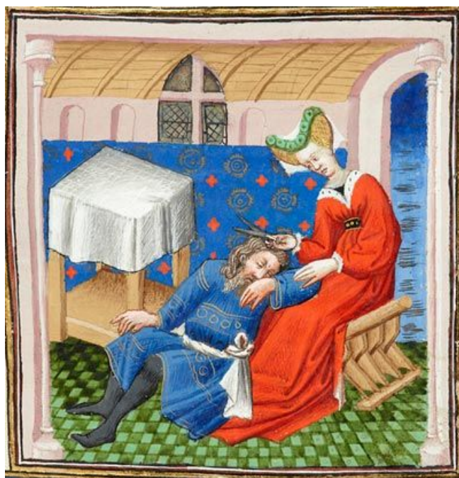
8-1. Detail; Samson and Delilah