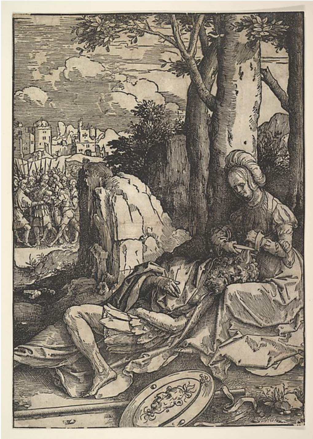
22. Lucas van Leyden Samson and Delilah (Large Power of Women Series) c. 1514 Woodcut, 41.8 x 29.5 cm Metropolitan Museum of Art