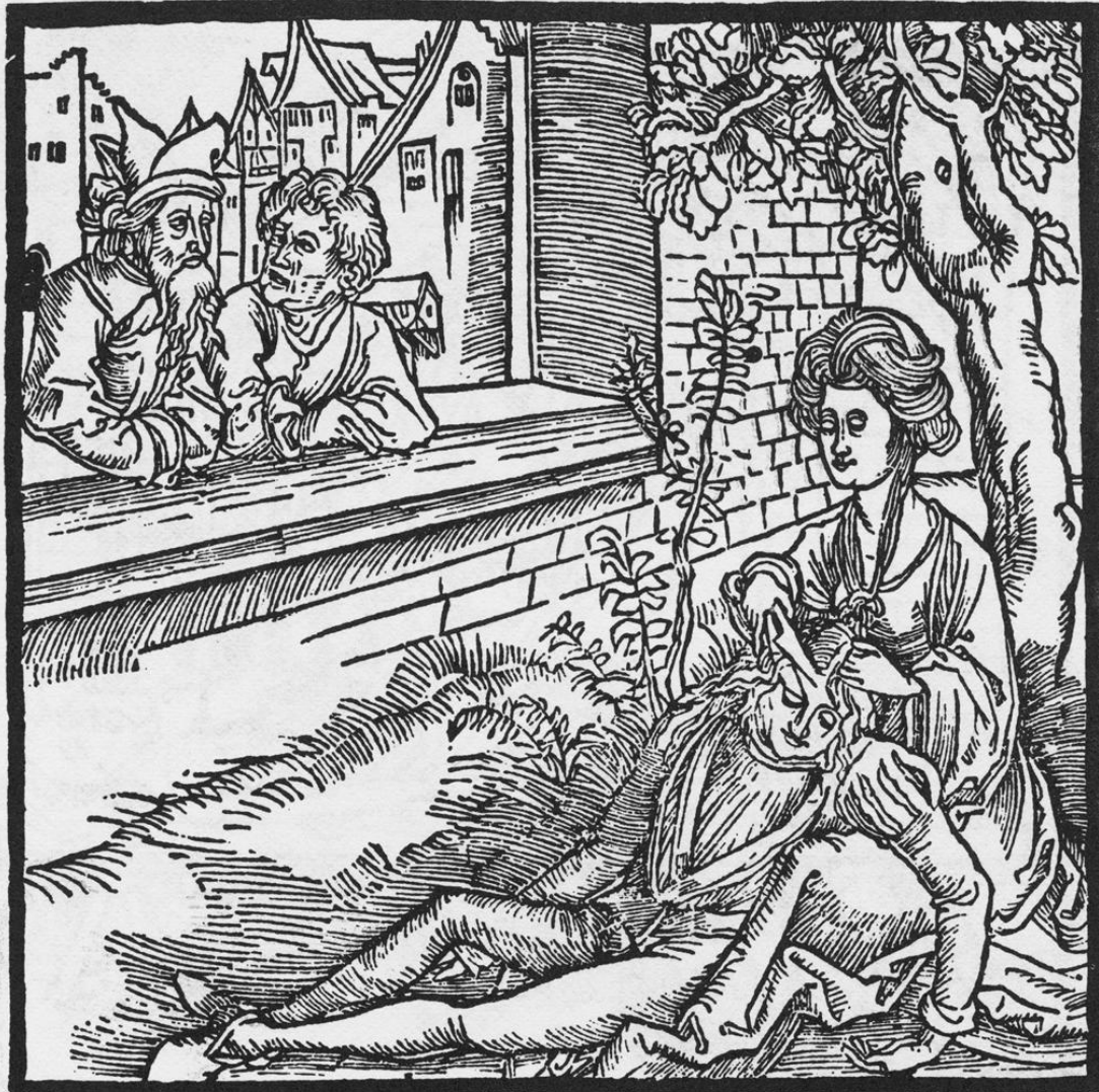
10. Albrecht Dürer Samson and Delilah Woodcut for Der Ritter vom Turn , Basel 1493