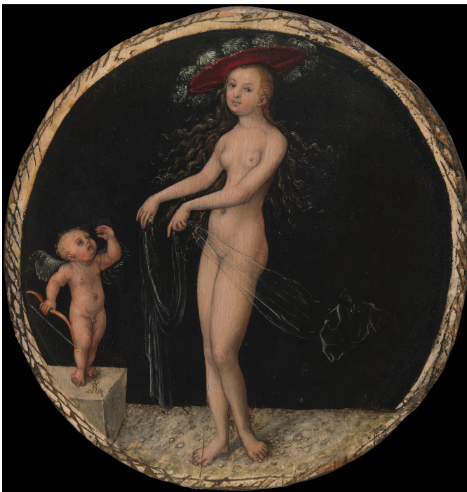
4. Lucas Cranach Venus and Cupid c. 1525-1527 Oil on wood, 12.1 cm (diameter) Metropolitan Museum of Art