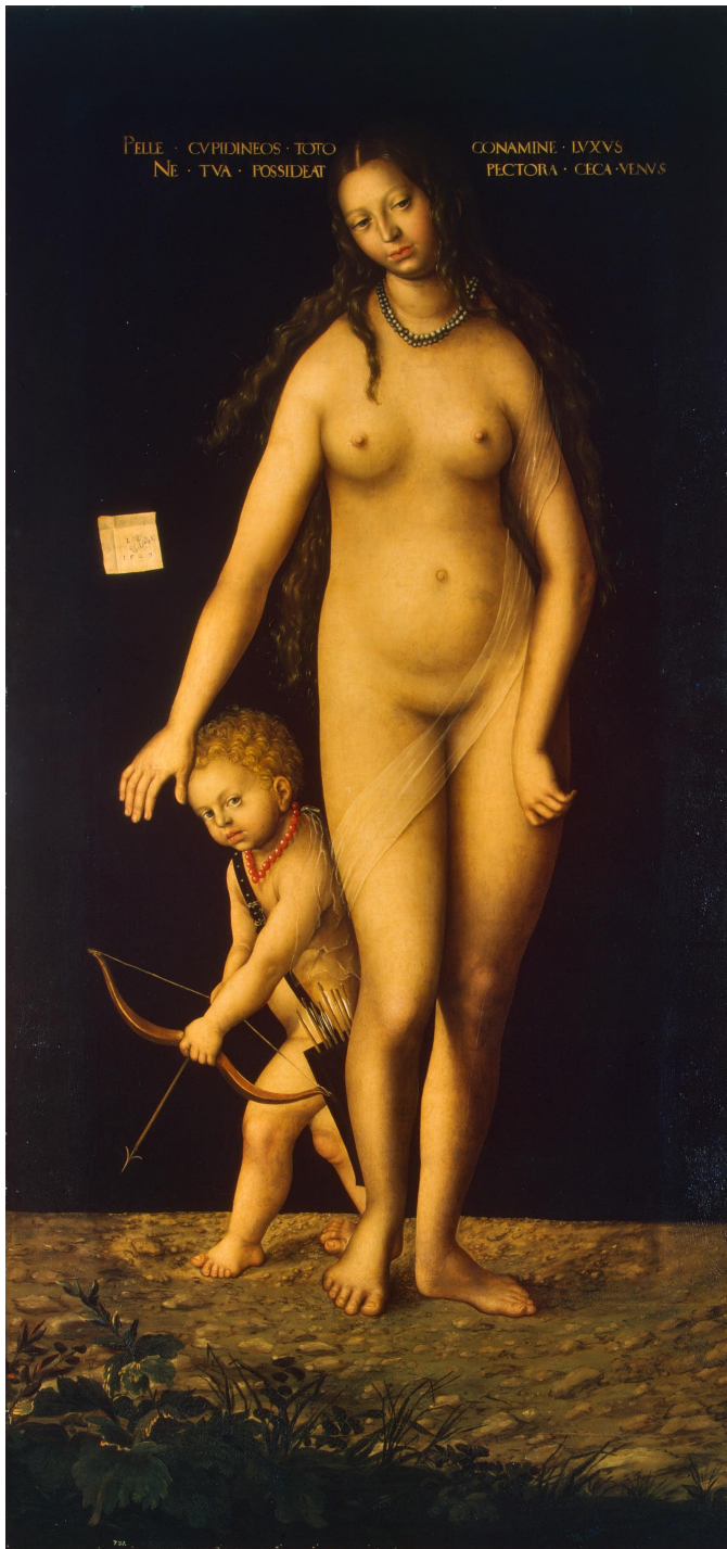
2. Lucas Cranach Venus and Cupid 1509 Oil on panel Hermitage Museum, St. Petersburg