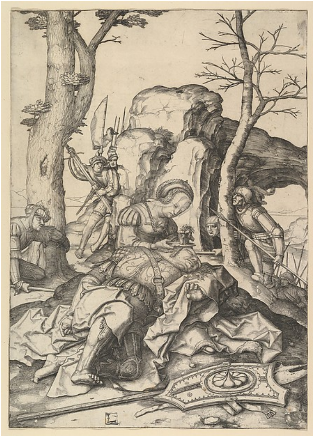
21. Lucas van Leyden Samson and Delilah c. 1508 Engraving, 28.3 x 20.2 cm Metropolitan Museum of Art