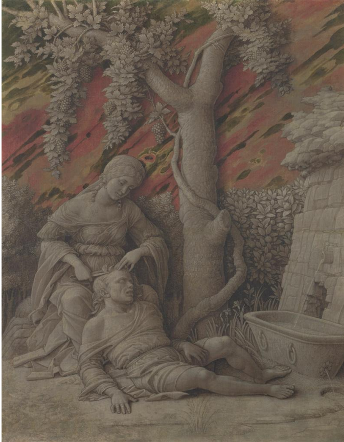
11. Andrea Mantegna Samson and Delilah c. 1500 Glue size on linen, 47 x 36.8 cm National Gallery of Art, London