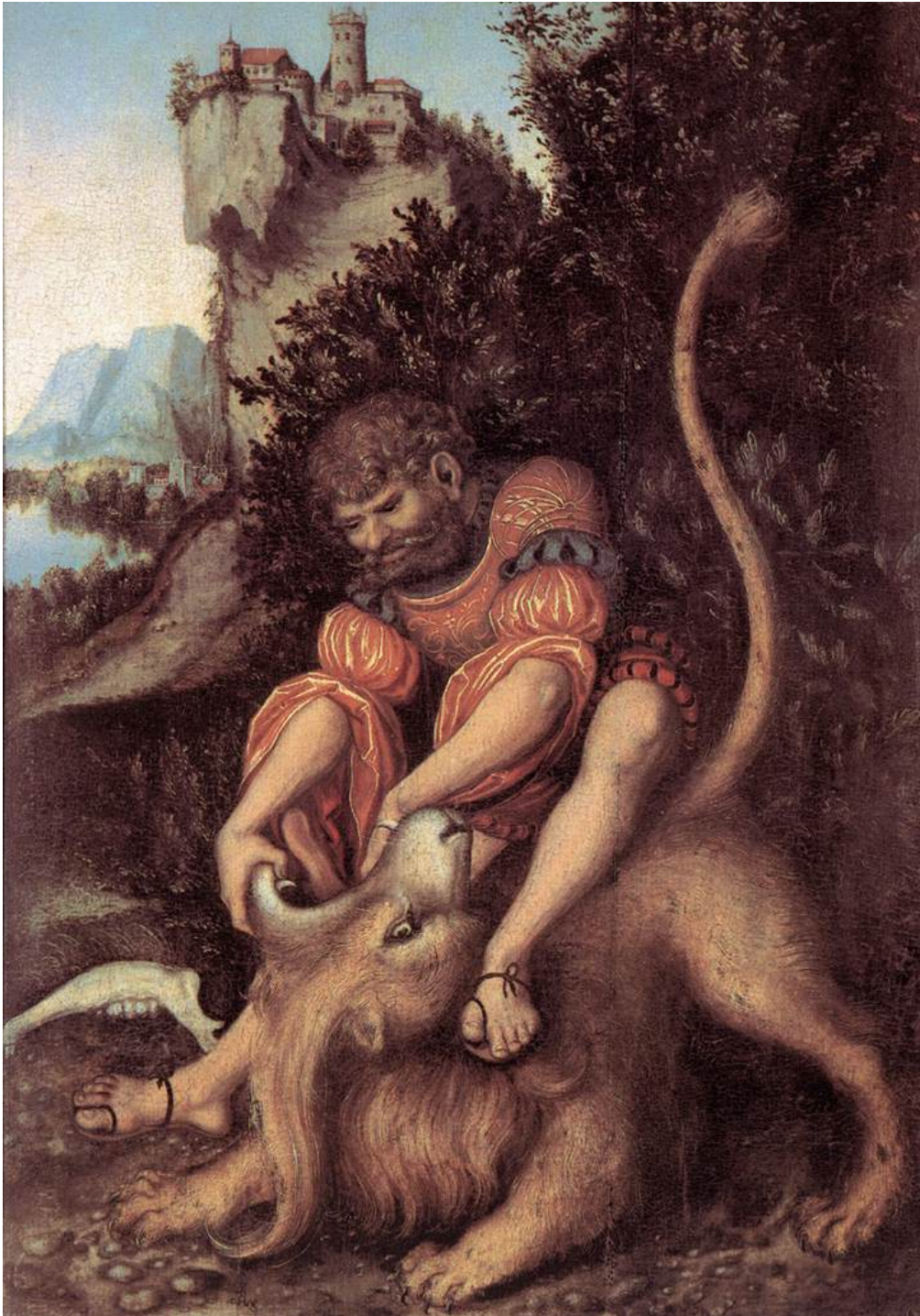
20. Lucas Cranach the Elder Samson Slaying the Lion 1528-30 Oil on beech panel, 56.7 x 38 cm Klassik Stiftung Weimar