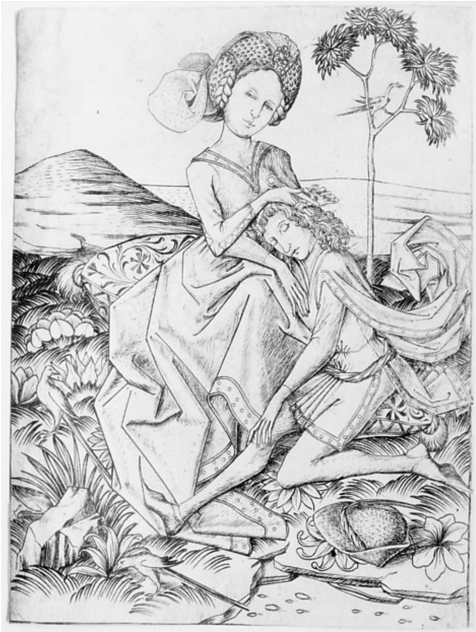
17. Master E.S. Samson and Delilah c. 1460-65 Engraving, 13.8 x 10.7 cm Metropolitan Museum of Art