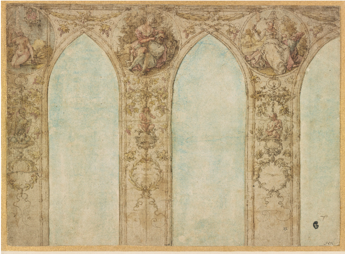
14. Albrecht Dürer Design for Decoration of the Town Hall of Nuremberg 1521 Drawing, 25.6 x 35.1 cm The Pierpont Morgan Library