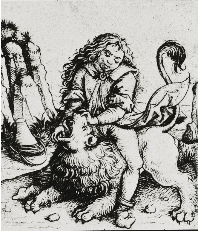
18. Master of the Housebook Samson Slaying the Lion 1460-75 Engraving, 9.1 x 8.2 cm Rijksprentenkabinet, Amsterdam