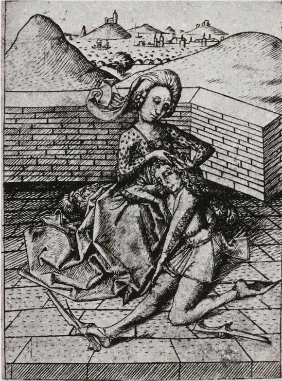
15. Master E.S. Samson and Delilah 1463 Engraving, 9.5 x 6.7 cm Coburg, Kunstsammlungen der Veste Coburg, Kupferstichkabinett