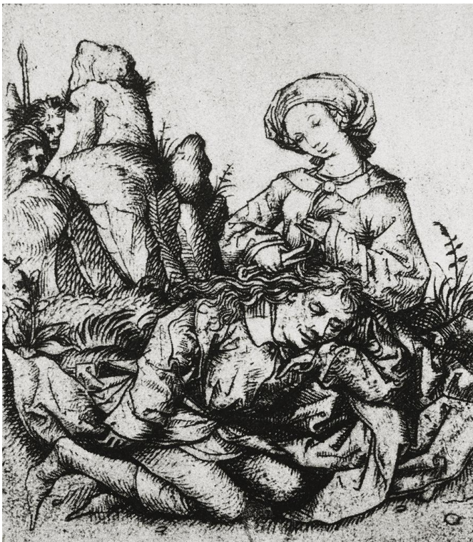
19. Master of the Hosuebook Delilah Cutting Off Samson's Hair 1460-75 Engraving, 9.4 x 8.3 cm Bibliotheque Nationale, Paris