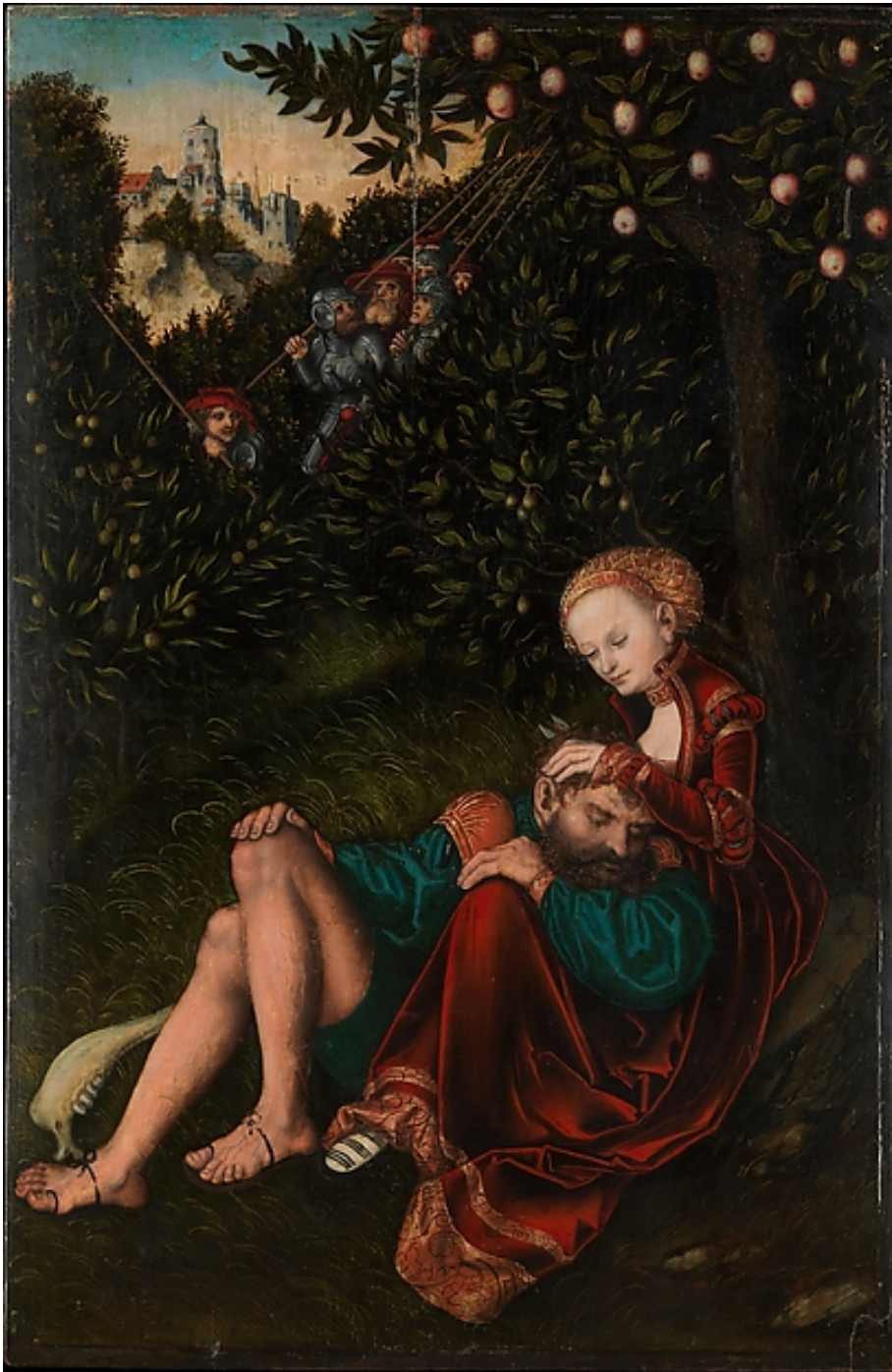
1. Lucas Cranach Samson and Delilah 1528-30 Oil on beech panel, 57.2 x 37.8 cm Metropolitan Museum of Art