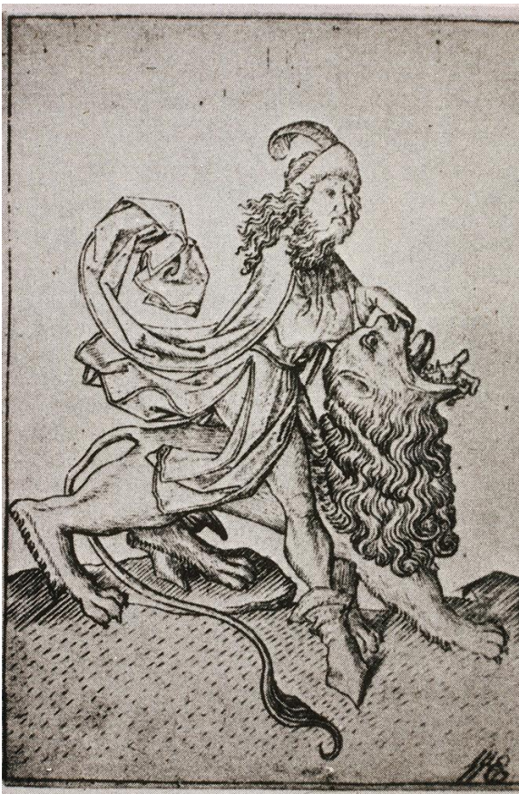
16. Master E.S. Samson Killing the Lion 1463 Engraving, 9.3 x 6.4 cm Klein-Öls, Sammlung Graf York von Wartenberg