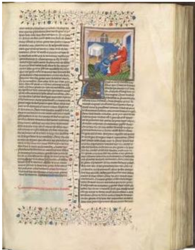
8. Guyart des Moulins Bible historique , in French Illuminated by the workshop of the Boucicaut Master France, Paris c. 1415-20 45 x 33 cm M.394, fol. 112r Pierpont Morgan Library