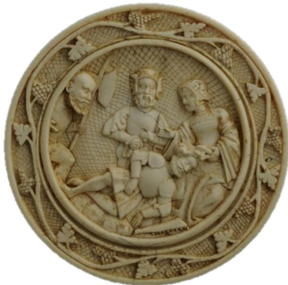
12. Mirror case with Samson and Delilah 16 th Century Germany Ivory, 14.4 cm (diameter) Turin, Palazzo Madama-Museo Civico d'Arte Antica