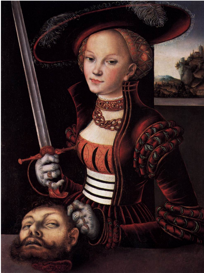
3. Lucas Cranach Judith Victorious c. 1530 Oil on wood, 75 x 56 cm Jagdschloss Grünewald, Berlin