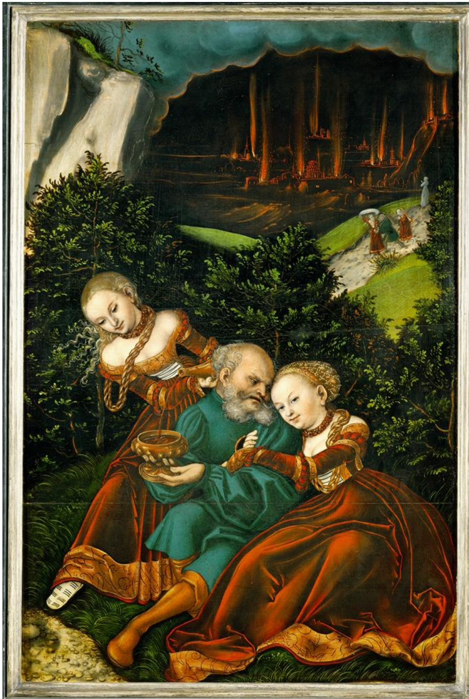
6. Lucas Cranach Lot and His Daughters 1528 Oil on beech wood, 56 x 37 cm Kunsthistorisches Museum, Vienna