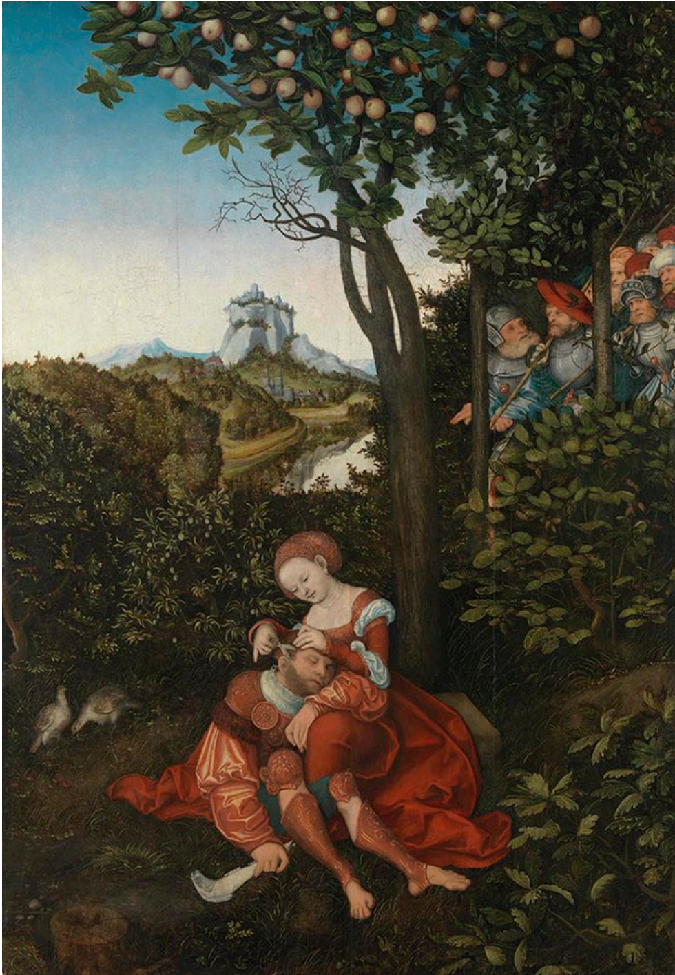
13. Lucas Cranach Samson and Delilah 1529 Oil on linden panel 117.2 x 81.9 cm Kunstsammlungen und Museen Augsburg