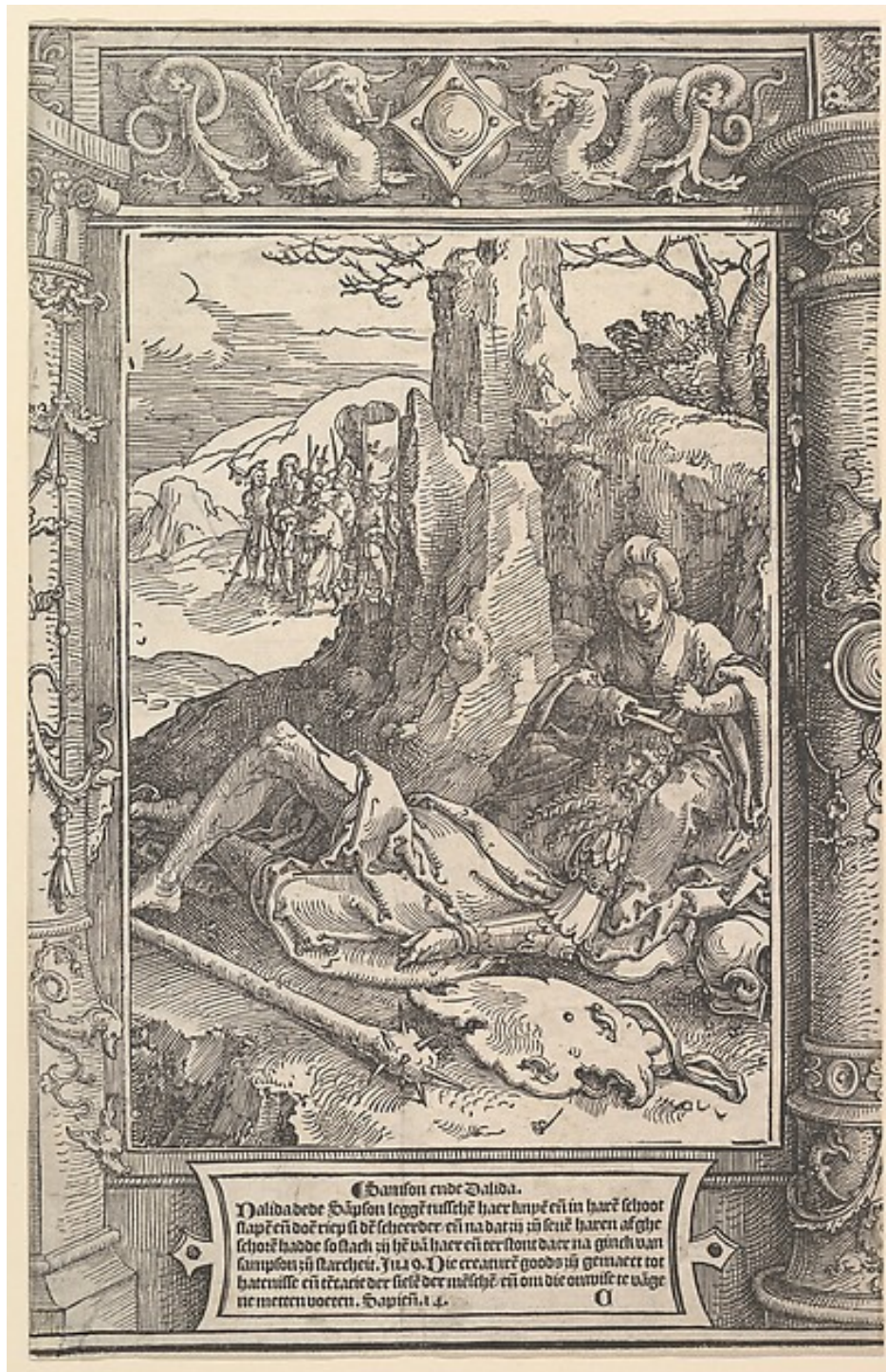
23. Lucas van Leyden Samson and Delilah (Small Power of Women Series) c. 1517 Woodcut, 24.3 x 17.1 cm Metropolitan Museum of Art