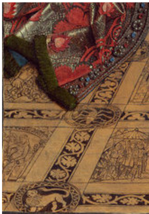
9-1. Detail lower left

9. Jan van Eyck The Annunciation c. 1434/1436 Oil on canvas transferred from panel 90.2 x 34.1 cm National Gallery of Art, Washington