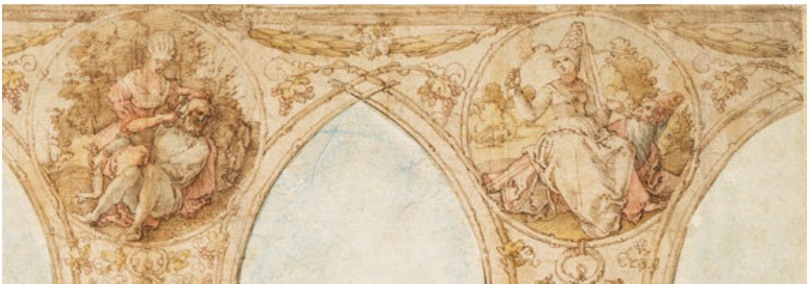
14-1. Detail; Samson and Delilah; Phyllis and Aristotle