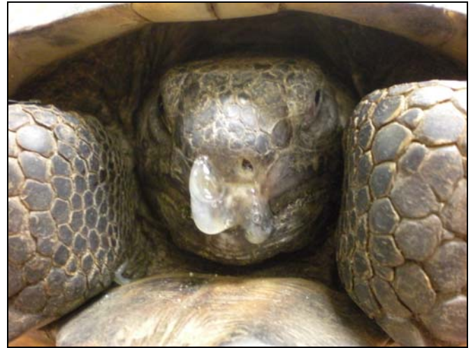
Figure 1. Gopher tortoise from Baker County, Georgia, with nasal exudate and swollen eyes consistent with the clinical signs of URTD.

of the eyes and nares (Figure 1.). Although both Mycoplasma species can cause clinical disease in gopher and desert tortoises, disease does not always develop in naturally infected tortoises.