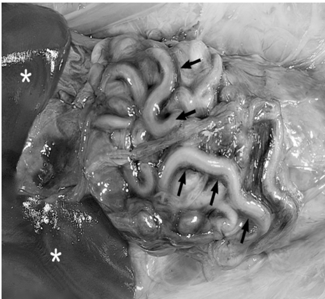
Figure 1. The abdominal viscera of a great blue heron covered by a mat of nematodes encased in tubes of fibrous connective tissue (arrows). The proventriculus is beneath the mass of nematodes, but is not visible. The liver (asterisks) is oriented on the left side of the photograph.

The larvae also cause disease in other species. For instance, garter snakes may develop severe disease if they feed on infected killifish. The larvae have even sickened humans who have been bold enough, and perhaps bored enough, to swallow live bait fish. This is a rare occurrence, and the species of fish affected by larval Eustrongylides sp., principally minnows, such as mosquito fish and killifish, are not common food items for people. (Prepared by Kevin Keel)