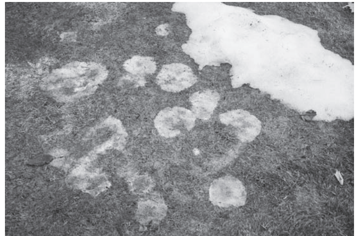
Gray snow mold March 1, 2010, Lincoln, NE.

Low-temperature kill is caused by ice crystal formation at temperatures below 32 degrees F. Factors that affect low-temperature kill include hardiness level, freezing rate, thawing rate, number of times frozen, and post-thawing treatment (Beard, 1973). Soil temperature is more critical than air temperature for low-temperature kill because the crown of the plant is at or near the soil surface. It is difficult to provide absolute killing temperatures because of the numerous factors involved. Beard (1973) provided a general ranking of low-temperature hardiness for turfgrass species that were autumn-hardened.