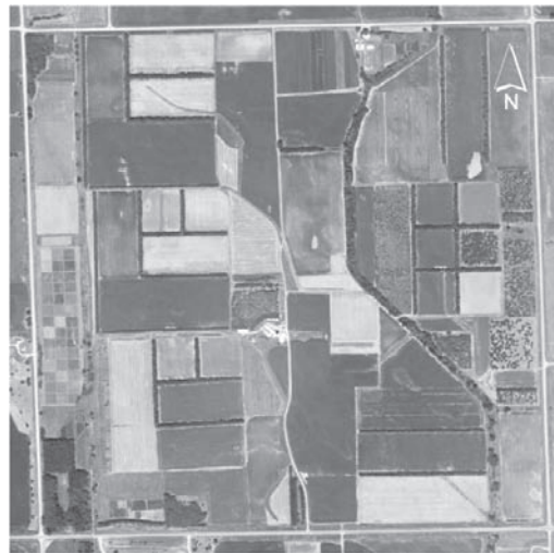
UNL ARDC Agroforestry Research Farm

Associated biodiversity – Species and ecosystems that interact with farm systems but are not typically managed for as part of a farm operation.