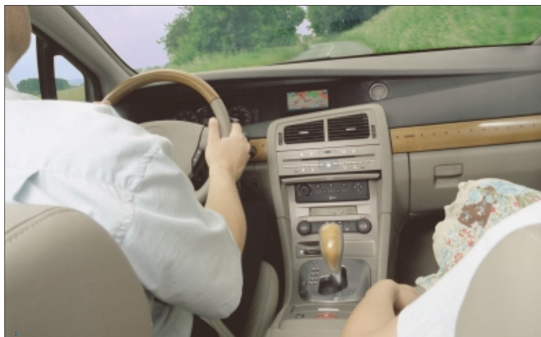
Using Galileo services for car navigation might be very interesting....

At the time of writing, the allocation process for concession to operate the system has narrowed down the competition to two remaining consortia: Eurely and iNavSat. The former comprises at the highest level Alcatel, Finmeccanica, Hispasat, AENA, Boeing, the Russian Federal Space Agency, Deutsche Bank, Chinasat and Navteq; the latter consortium comprises EADS Space, ING Bank, Inmarsat Ventures, the Thales Group, Boeing and the Russian Federal Space Agency. Later in 2005 the winner is to be decided, and by the end of 2005 or shortly thereafter further detailed negotiations on the concession should lead to a finalised concession agreement, probably covering a period of twenty years. Details of the concession will thus become clear only at that point and then, of course, only to the extent that they do not remain confidential for security and/or commercial reasons.