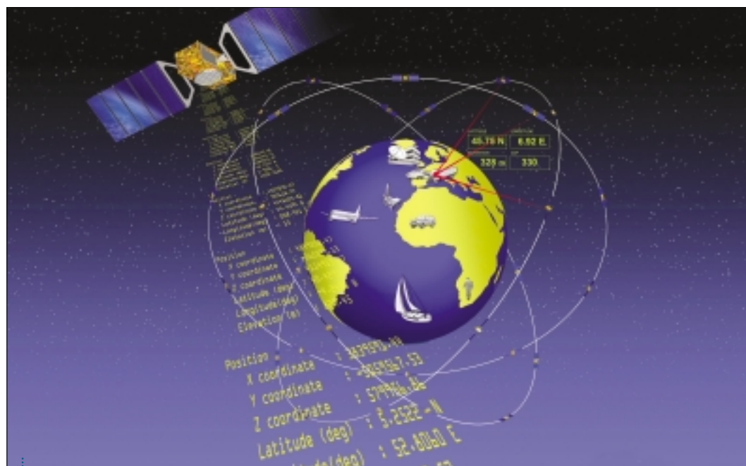
In 2008 or shortly thereafter Europe will have its own satellite navigation system: Galileo.

GLONASS led to the introduction the mid-1990s of Global Navigation Satellite Services (GNSS) in the civil sector. This caused a major evolution in the approach to various timing, positioning and navigation problems and needs, and stimulated a number of very important technological, operational and market developments. Whilst Europe profited to a considerable extent from these developments, for example through the European Geostationary Navigation Overlay System (EGNOS), such benefits were indirect and small compared to benefits in particular to the US economy. Moreover, the continuation of any such benefits remained totally de-