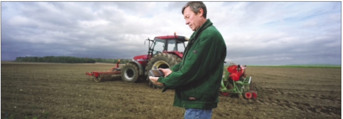
Agriculture: one of many potential down-stream value-added applications of Galileo services.

Finally, it has to be pointed out once more that the real value of intellectual property rights depends not only on the applicability and application of relevant legal regimes to protect them, but also on