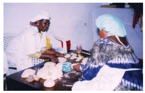
Training participants making chapatti dough in Dar es Salaam