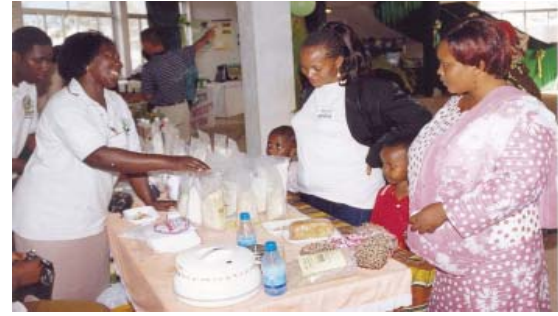
Sorghum and pearl millet-based food products on display at a food fair in Tanzania