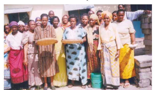
Members of three Tanzanian women's groups admiring sorghum buns baked during a training session in Dar es Salaam

The research portion of this project is targeted toward grain quality/product development issues that can be directly applied to improving U.S. sorghum quality as well as developing new prototype sorghum products applicable for U.S. consumption and export markets. This will include improvement in the quality of sorghum used in food products made for individuals with wheat intolerance and for sorghum-based snack foods that are shipped to Asian countries and will improve the quality of sorghum and pearl millet starch used for ethanol production.