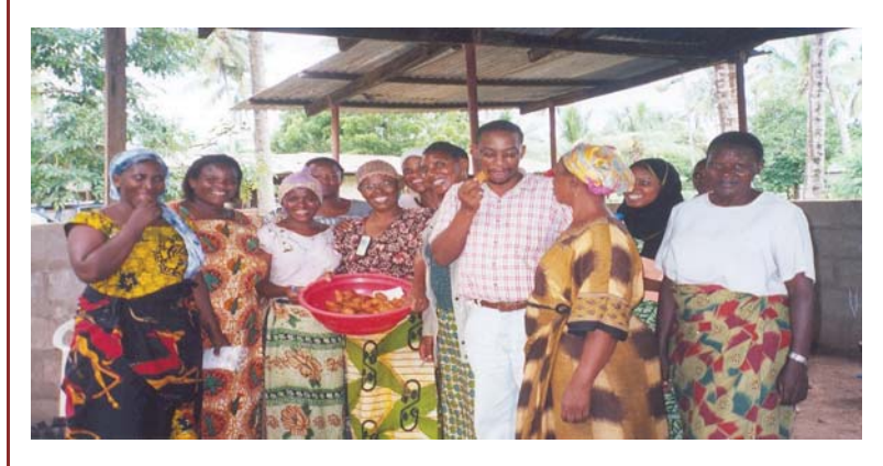
Dar es Salaam training participants tasting sorghum-based buns