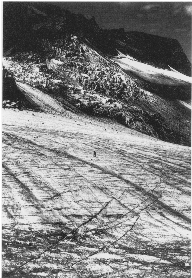
FIGURE 2. Ablation zone of Knife Point Glacier, Wyoming. Collection sites A and B were within the depicted insect-bearing layers.

The identity of the grasshopper species collected from the glacier was determined using available taxonomic keys and diagnostic structures (e.g., male genitalia). Once a definitive identification to genus was accomplished,