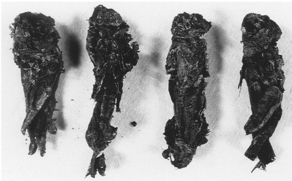
FIGURE 3. Partial and intact bodies of grasshoppers extracted from the ice of Knife Point Glacier, Wyoming.

The Melanoplus sp. females' genus was easily determined by the distinct conical spine inserted between the front legs (Capinera and Sechrist, 1985). However, the identification of Melanoplus species depends almost entirely on characteristics of the male genitalia, so the whole bodies could not be identified to species. However, the preserved epiphalli and cingulae were clearly those of M. sanguinipes or M. spretus (Walsh); they were virtually identical to those recovered from Grasshopper Glacier in the Beartooth Mountains, where the deposits have been tentatively identified as M. spretus . Morphometric analyses of diagnostic body parts was equivocal (Table 2). Unfortunately, there were few morphometrically diagnostic body parts preserved, and those of greatest value (i.e., diagnostic for both sexes) did not consistently support either species. Perhaps it should be noted that one entire tegmen measured 23.84 mm, which is within the range of M. spretus and well outside the range of M. sanguinipes (Lockwood, 1989). Given the age of the deposits, the density of grasshoppers within the deposits, and the biology of rangeland grasshoppers, it appears that Knife Point Glacier may contain a remarkably rich supply of the extinct Rocky Mountain locust (Lockwood and