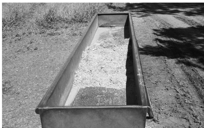
Feed bunk with a mixture of 30:70 modified distillers grains to ground cornstalks (DM basis); supplemented to pairs on grass to reduce grazed forage intake.

The following year, a similar trial was conducted using cows with spring-born calves at side grazing smooth brome grass pastures. Pairs were assigned to either a traditional stocking rate without supplementation or double stocked with supplementation. Again, supplementation levels were increased as the season advanced to replace approximately 50% of grazed forage intake (DM basis). In this experiment, a mixture of 50:50 modified distillers grains:cornstalks (DM basis) was used at the start of the season to encourage consumption while forage quality was high. Distillers grains were gradually removed from the supplement until a ratio of 30:70 co-product:forage was reached. Cow and calf gains were greater for supplemented pairs. However, grazed forage replacement rates were slightly less than the previous year. The modified distillers grains and cornstalk mixture reduced grazed forage intake by 33%. Thus, every lb of supplement replaced about 0.9 lbs of grazed intake. This experiment is being replicated this season to further evaluate replacement rates on cool-season pastures. Our data indicate using mixtures of low-quality forage and co-products to reduce grazed intake is more successful on smooth brome grass pastures in eastern Nebraska than on Sandhills upland range. Smooth brome grass pastures may be more resilient to overgraz-