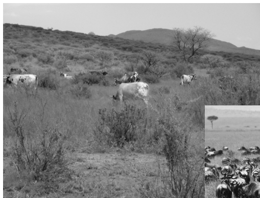
Cattle grazing bush-encroached grassland in Namibia.

Namibians recognize the attractiveness of their landscapes, wildlife and cultures. Since becoming independent in 1990, a focus of the Namibian government has been the development of its tourism industry, especially ecotourism. A network of commercial and communal conservancies has been developed where the natural landscapes and native wildlife are sustainably