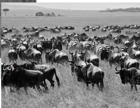
Wildebeest and zebra on grassland in Namibia.

grassland/savannah (receiving less than 14 inches of precipitation annually), which is used primarily for livestock and wildlife grazing. Similar to much of southern Africa, the grasslands and savannas have shifted to dense bushlands over the last century. About 50% of the commercial ranching areas of Namibia are affected by bush thickening,