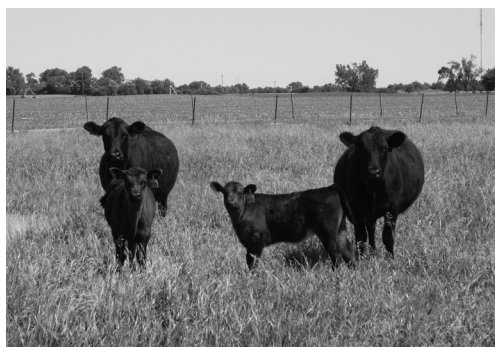
Cow-calf pairs grazing smooth brome grass pasture in eastern Nebraska in late May.

Research was initially conducted in 2007 at the Gudmundsen Sandhills Laboratory near Whitman, NE (2010 Nebraska Beef Cattle Report, p. 19). Cows with spring-born calves were assigned to one of three treatments: 1) stocked at the recommended stocking rate (0.6 AUM/acre) with no supplementation; 2) double stocked (1.2 AUM/acre) and supplemented with 14.6 lbs/hd/d (50% of estimated DMI) of a distillers grains/forage mixture; and 3) double stocked (1.2 AUM/acre) with no supplementation. The supple-