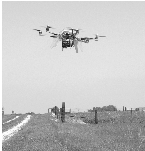
Figure 1. Multi-rotor radio controlled aircraft used for data collection.