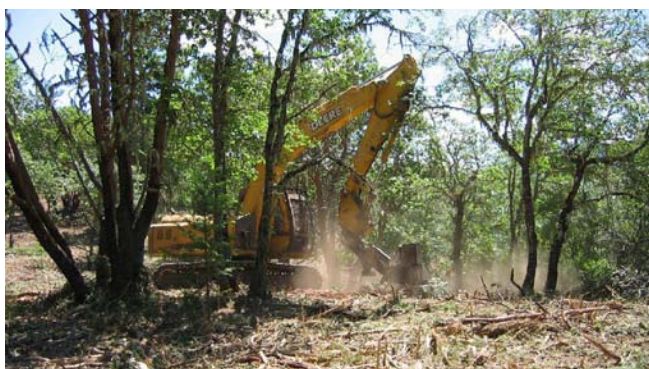
Mechanical mastication being performed using a Slashbuster™.