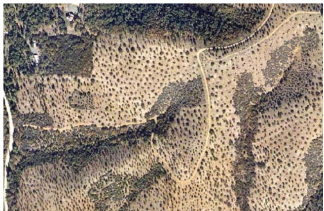
Striking results: same area of oak and chaparral after thinning.