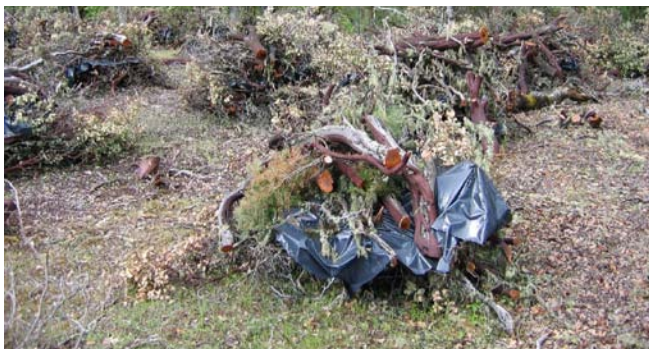
After being cut manually, several hand piles are prepared for burning.

Today, due to expansion of residential property into the rural vicinity of the Applegate Valley Adaptive Management Area, the need for effective fire management is more pertinent than ever.