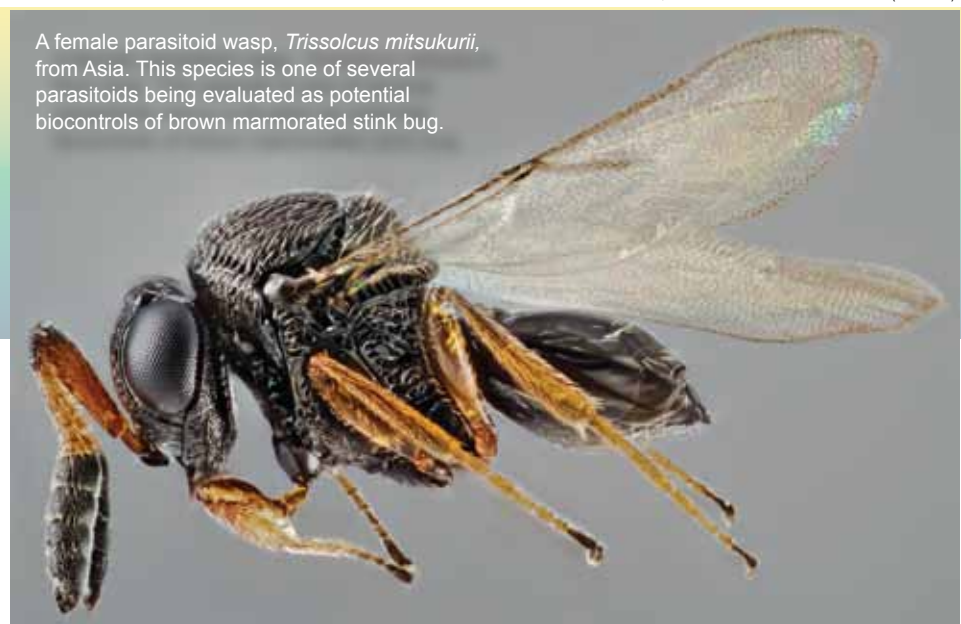
A female parasitoid wasp, Trissolcus mitsukurii , from Asia. This species is one of several parasitoids being evaluated as potential biocontrols of brown marmorated stink bug.