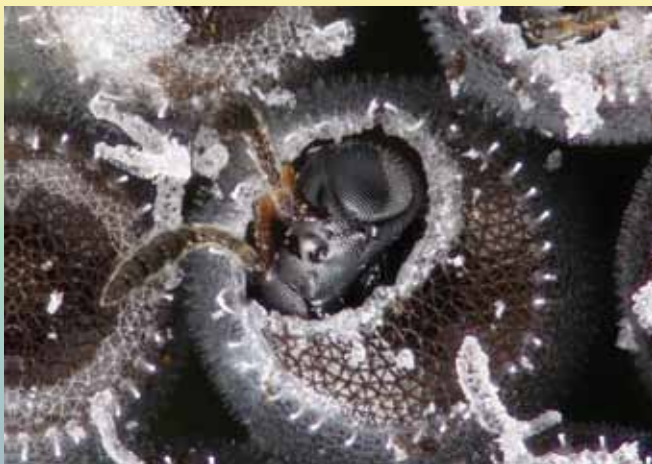
An adult parasitoid insect emerging from an egg of a stink bug. After a parasitoid female wasp lays an egg into a stink bug egg, the parasitoid offspring (one per egg) develops inside the egg, eating it from the inside out.

To reach scientists mentioned in this article, contact Sharon Durham, USDA-ARS Information Staff, 5601 Sunnyside Ave., Beltsville, MD 20705-5129; (301) 504-1611, sharon.durham@ars.usda.gov . ❀