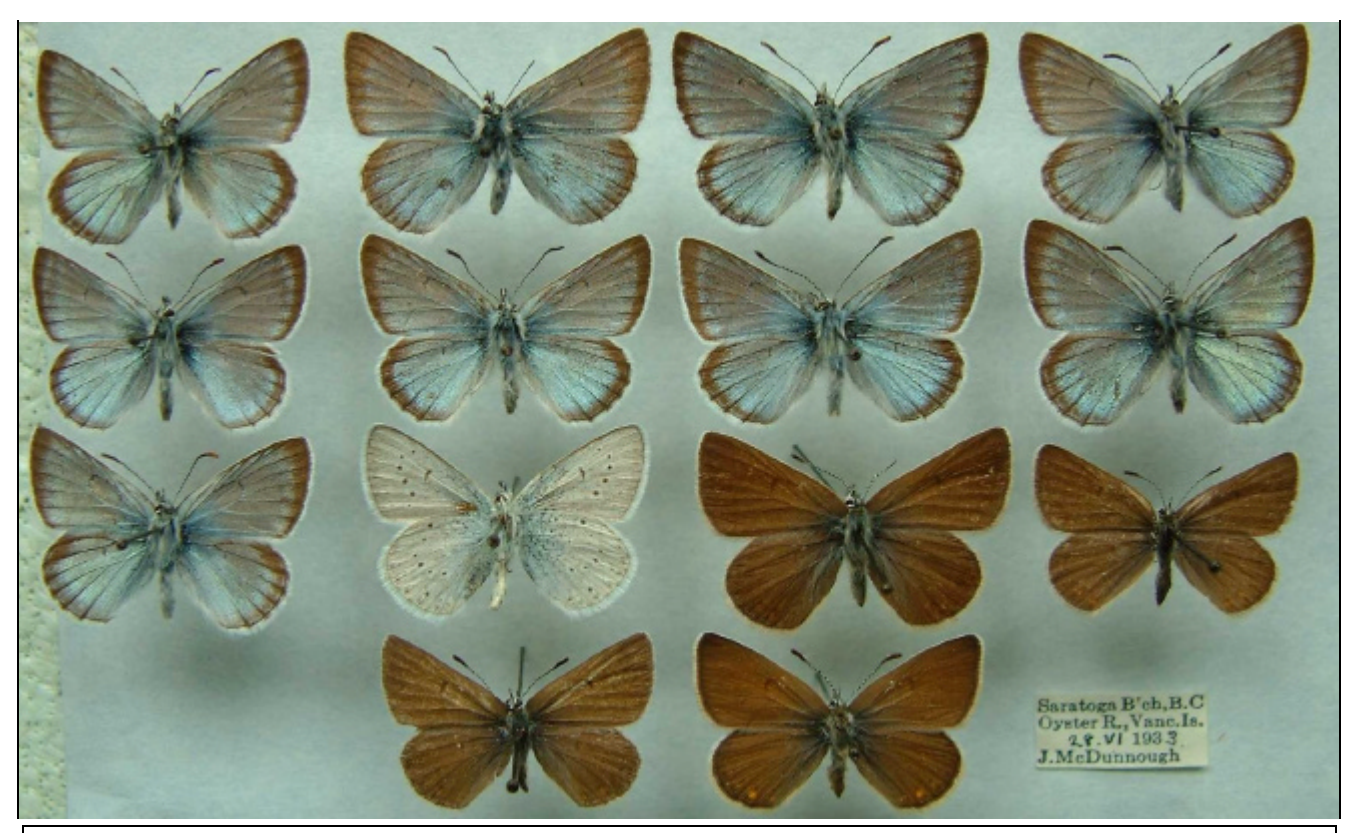
Figure 11. Additional insulanus specimens. More than one collection date on individual specimen labels, otherwise all labels are identical to the example shown.