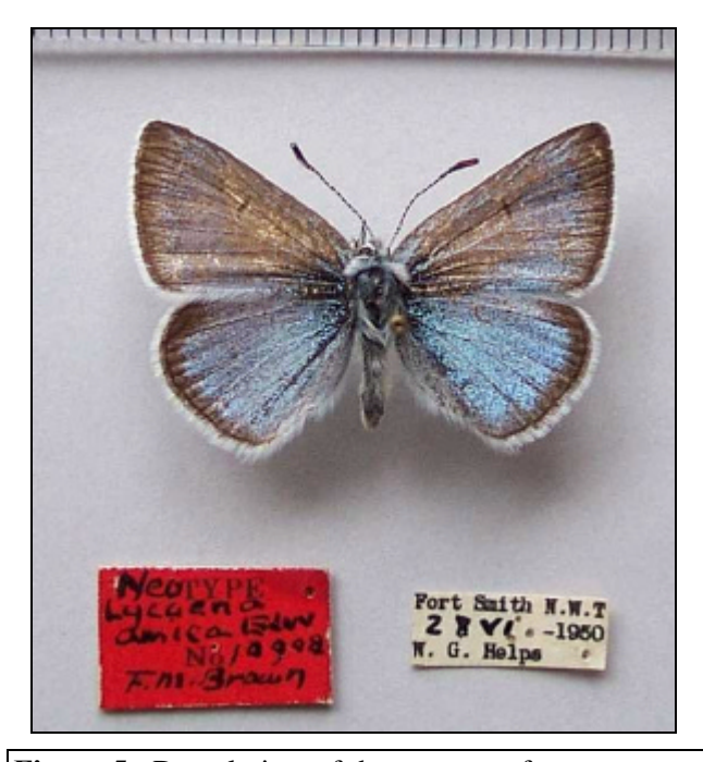
Figure 5. Dorsal view of the neotype of amica in the CNC.