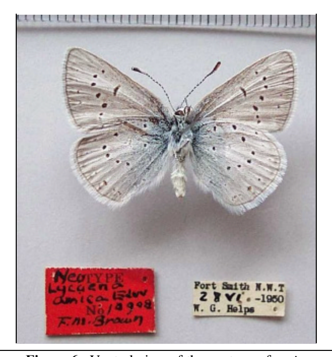
Figure 6. Ventral view of the neotype of amica in the CNC.