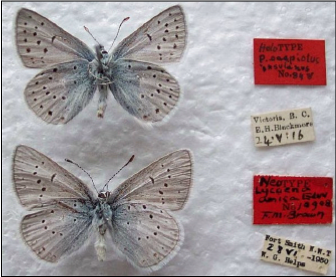
Figure 8. Ventral view of insulanus (top) and amica (bottom) types.