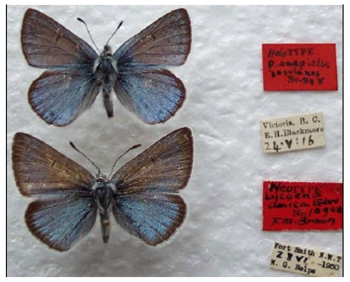
Figure 7. Dorsal view of insulanus (top) and amica (bottom) types.

It is clear from this brief review that there are numerous and conflicting interpretations regarding Aricia saepiolus in northwestern North America. It is equally clear that there is insufficient information presented in the literature to allow an unambiguous assessment of which interpretation is most defensible and congruent with reality in the field. There is no clarity as to where saepiolus grades into insulanus and amica or even if they do. There is no clarity as to where kodiak grades into amica . The literature also presents differing descriptions of the appearance of the taxa under discussion. We do not elaborate on that here since it is more appropriate to include in a future taxonomic review.