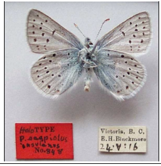
Figure 4. Ventral view of the putative insulanus "holotype" (now a lectotype) in the CNC.