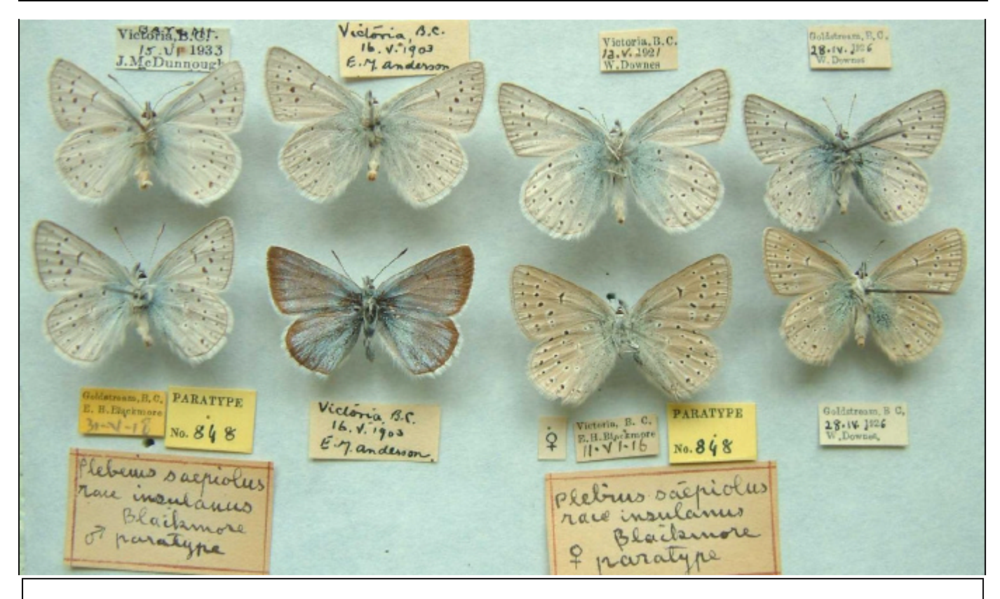
Figure 10. Aricia saepiolus insulanus specimens from the type locality.