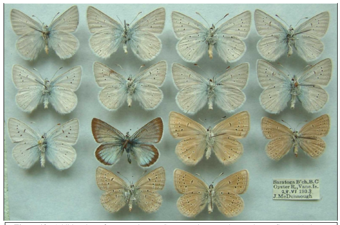
Figure 12. Additional insulanus specimens. Same specimens and same data as figure 11 above.