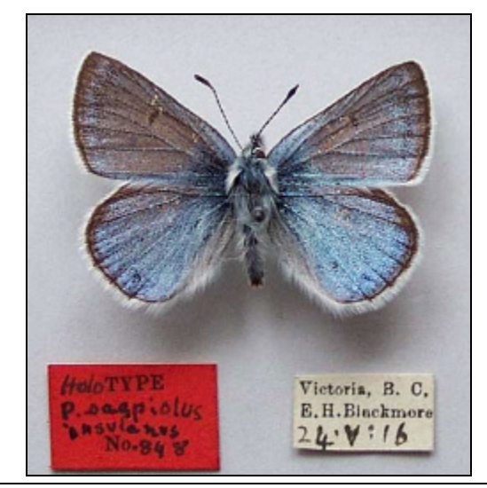
Figure 3. Dorsal view of the putative insulanus "holotype" (now a lectotype) in the CNC.