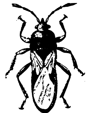
Adult chinch bug

The best management strategy in the seven high-risk and four transition-zone counties (see IPW News 90-1; March 9, 1990), is to plant soybeans or another nonhost crop near infested wheat. In these 11 counties, producers enrolled in the farm program can use a prevented planting option and still maintain the sorghum history on their farm. We strongly recommend using this management strategy on any or all fields on a producer's farm, but a grower must have county ASCS approval before planting an alternative crop. For more information about the prevented planting option, contact your local extension agent or ASCS office.