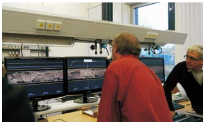
Figure 3. Corelyzer station at the IODP Exp. 313 New Jersey Shallow Shelf onshore science party at MARUM (University of Bremen). This station was fed continuously with scanned images and MSCCL data of new core sections as they were added to the ExpeditionDIS. In conjunction with Correlator, this station was used for correlation between sites using lithological features and/or logging data.

ExpeditionDIS via the Common Exchange Format file. Upon selecting a subset of core sections or all core sections for a drill hole, a non-editable, continuous sequence, scaled to the driller depth, is displayed.