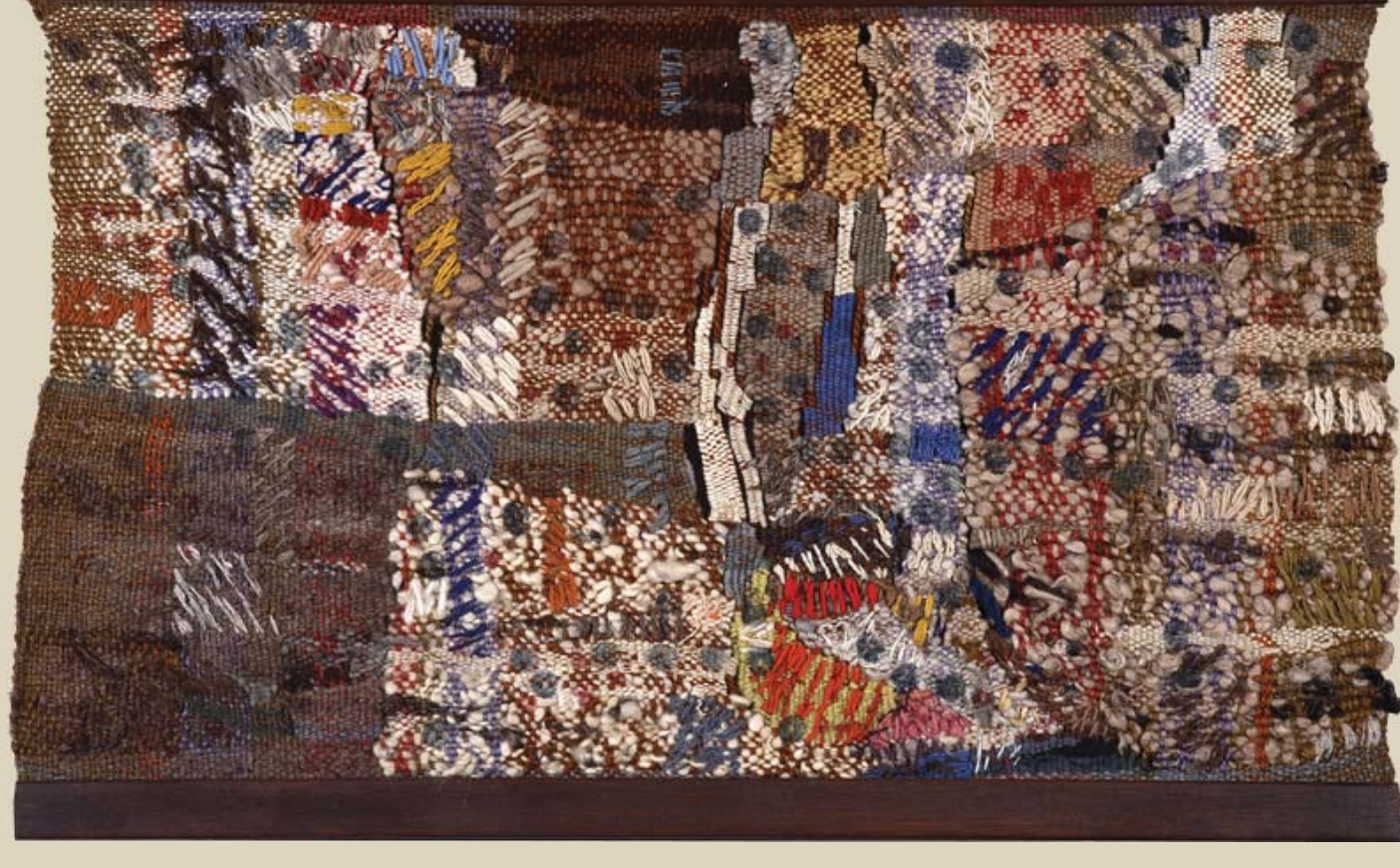
Color it Twill , Lillian Elliot, 1973

Tugboat Gallery www.tugboatgallery.com (402) 477-6200