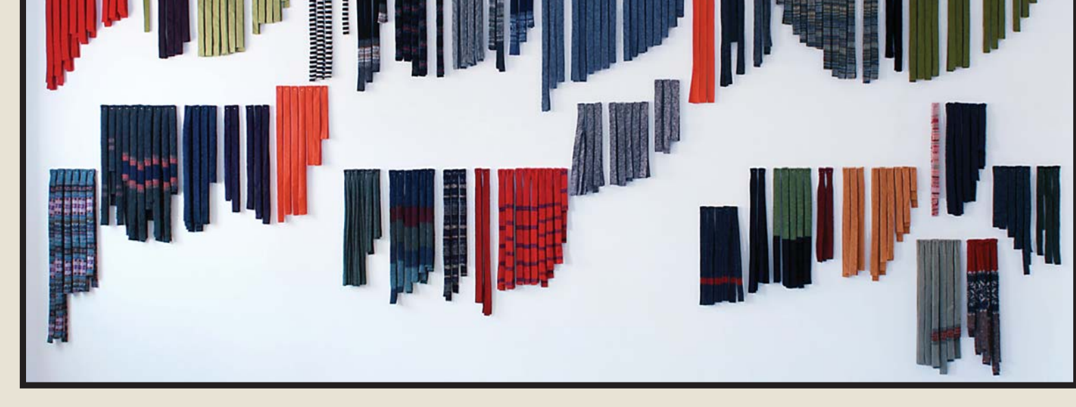
Inventory , Marcie Miller Gross 2008, used felted wool sweater parts, seams, pins