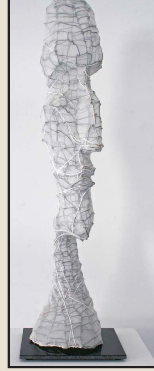
Transitions No. 1 , Soonran Youn steel wire, silk-screen fabric, synthetic thread