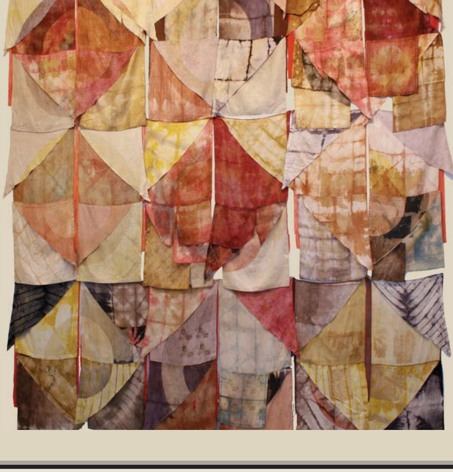
Shot Through The Heart , Frances Dorsey 2010, used linen napkins, tablecloths, natural dyes and extracts; printed and discharged; 132" x 132"