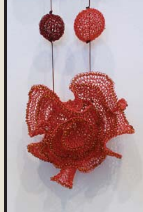
Necklace , Soonran Youn enamel copper wire, beads, string