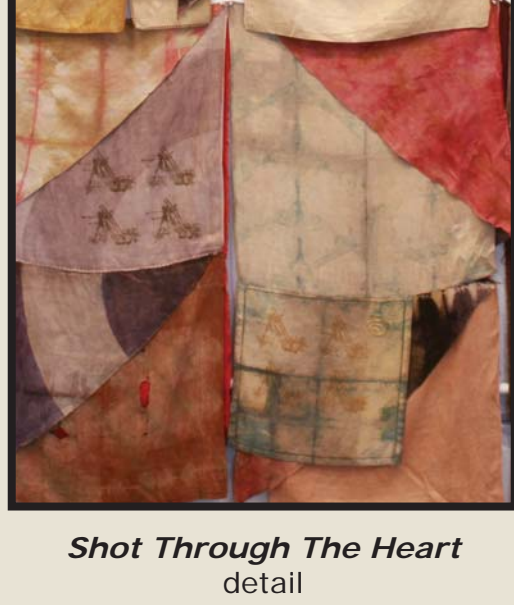
Shot Through The Heart detail