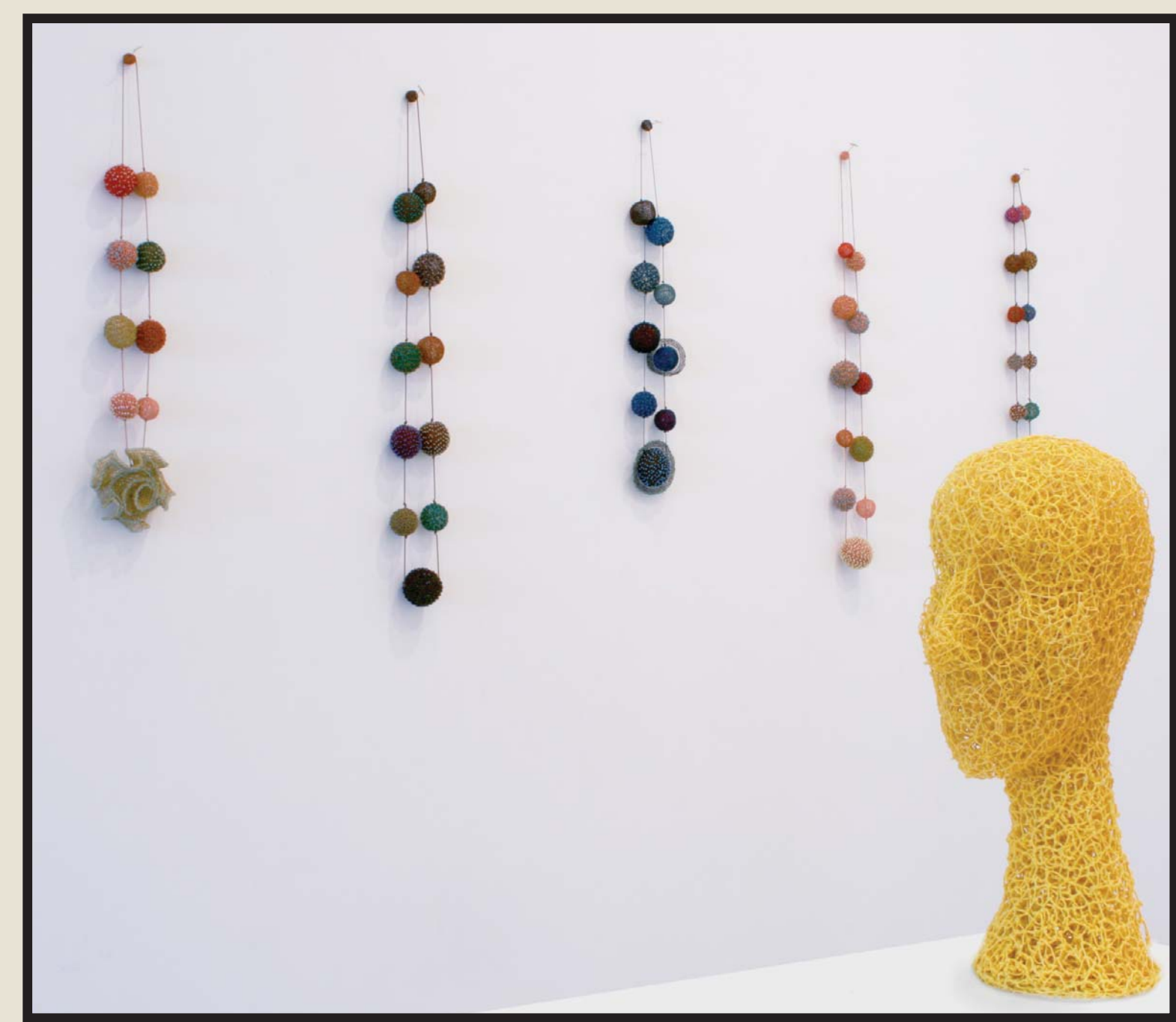
Neclaces and Transition , Soonran Youn