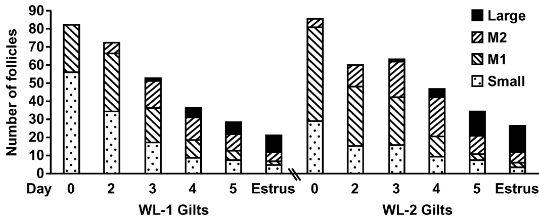
Figure 1. Number of small (2 to 2.9 mm; Day, P < 0.001 ), medium-1 (M1, 3 to 4.9 mm; Day, P < 0.001 ), medium-2 (M2, 5 to 6.9 mm; Day, P < 0.01 ), and large follicles ( \geq 7 mm; Day, P < 0.001 ) following \text{PGF}_{2\alpha} on d 13 of the estrous cycle (d 0 of follicular development); total number of follicles decreased with day, P < 0.001 . Line did not affect total number of follicles ( P = 0.18 ), nor the number of small ( P = 0.10 ), M1 ( P = 0.35 ), M2 ( P = 0.90 ), or large ( P = 0.90 ) follicles. WL-1 = control line; WL-2 = line selected for ovulation rate and prenatal survival.