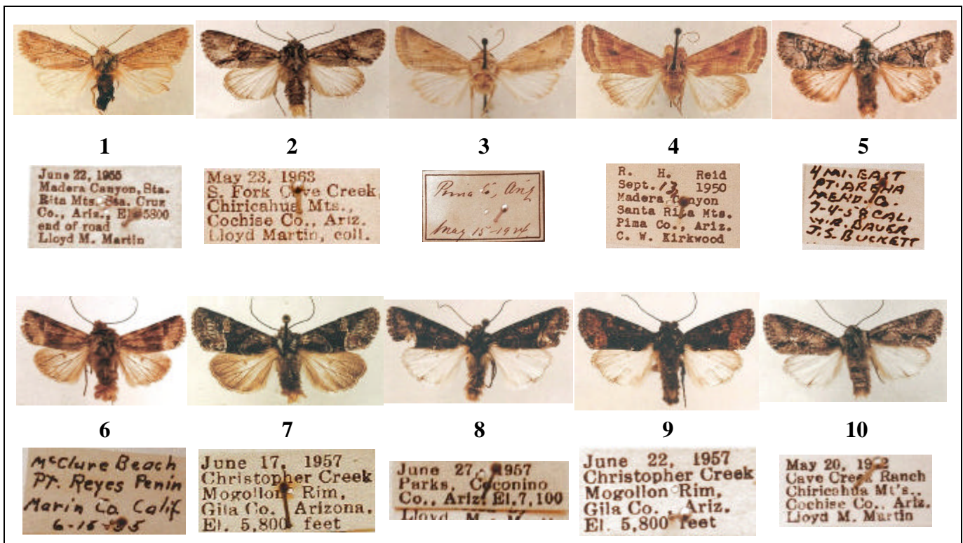
Figures 1–10. New Lacinipolia species. Fig. 1. Paratype ♂: L. delongi . Fig. 2. Paratype ♂: L. aileenae . Fig. 3. Holotype ♂: L. triplehorni . Fig. 4. Allotype ♀: L. triplehorni . Fig. 5. Paratype ♂: L. bucketti . Fig. 6. Paratype ♂: L. baueri . Fig. 7. Paratype ♂: L. sharonae . Fig. 8. Paratype ♂: L. fordii . Fig. 9. Paratype ♂: L. franclemonti . Fig. 10. Paratype ♂: L. martini .

The genotype of Lacinipolia is Mamestra illaudabilis Grote, 1875. In Poole's 1989 Noctuid catalog, 76 species are listed, confined to North, Central and South America. Of these, 58 are found in North America (MONA, 1983 plus Leuschner, 1992). One additional species was described by Mustelin in 2000; this paper adds nine more, so the above totals are increased by ten to 86 and 68 respectively.